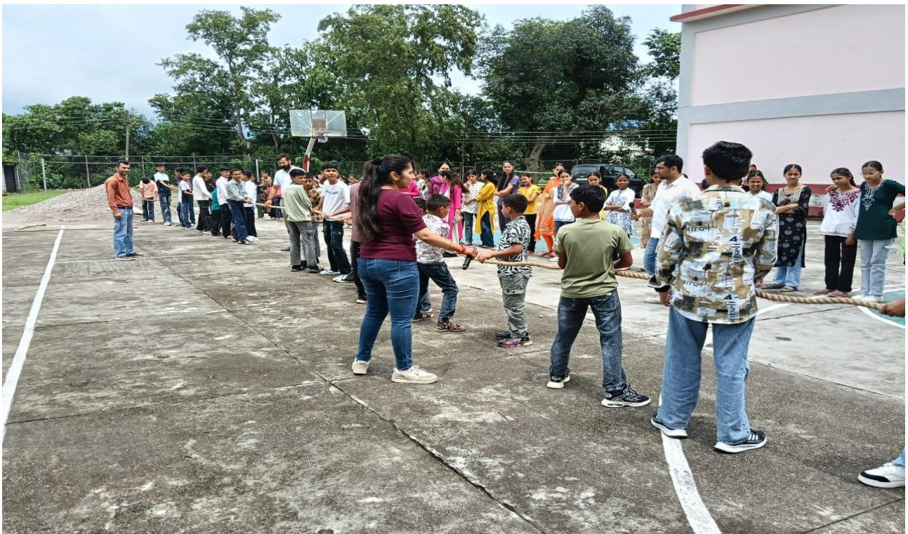
A tug of war competition took place within the junior group.