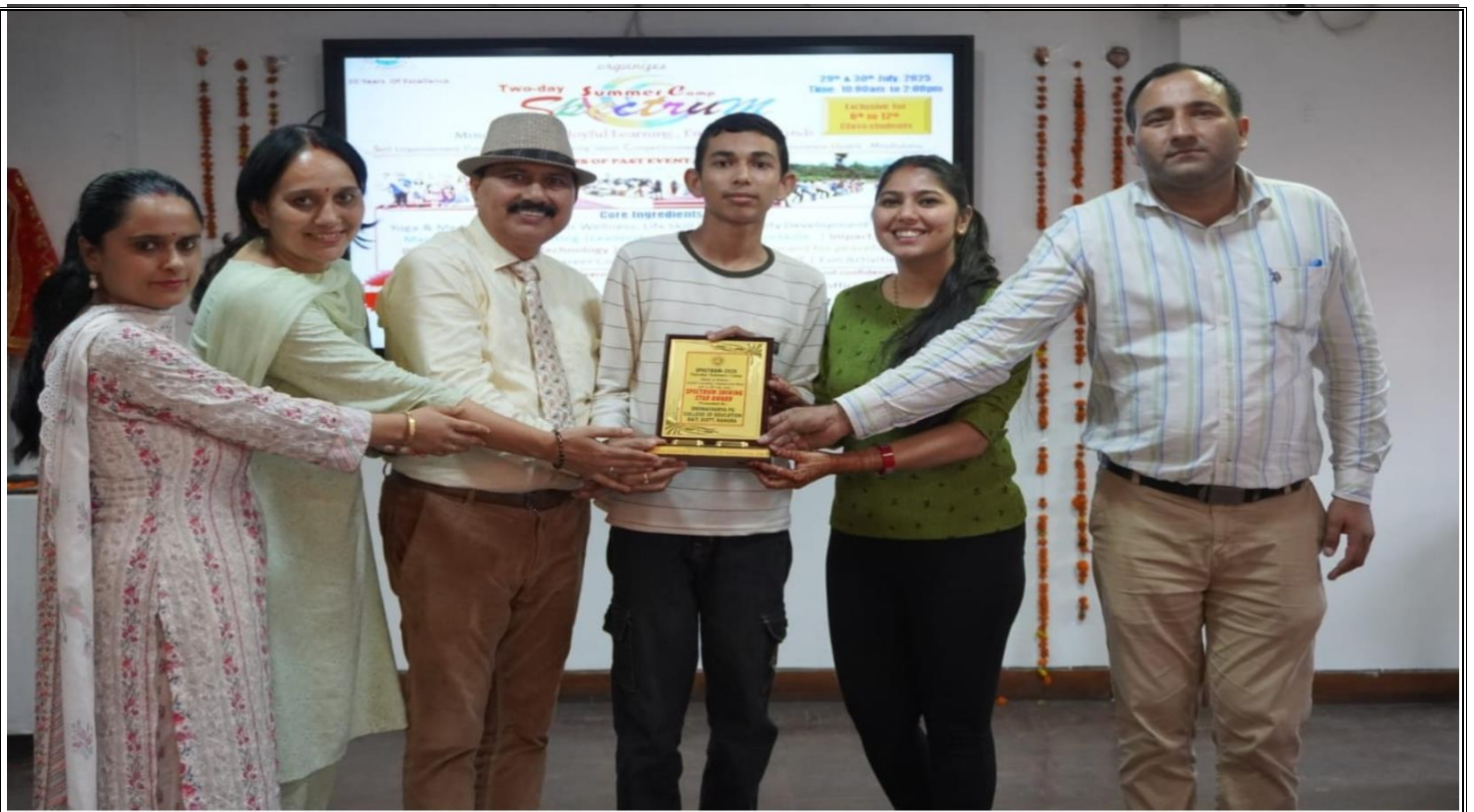
Felicitation of winners