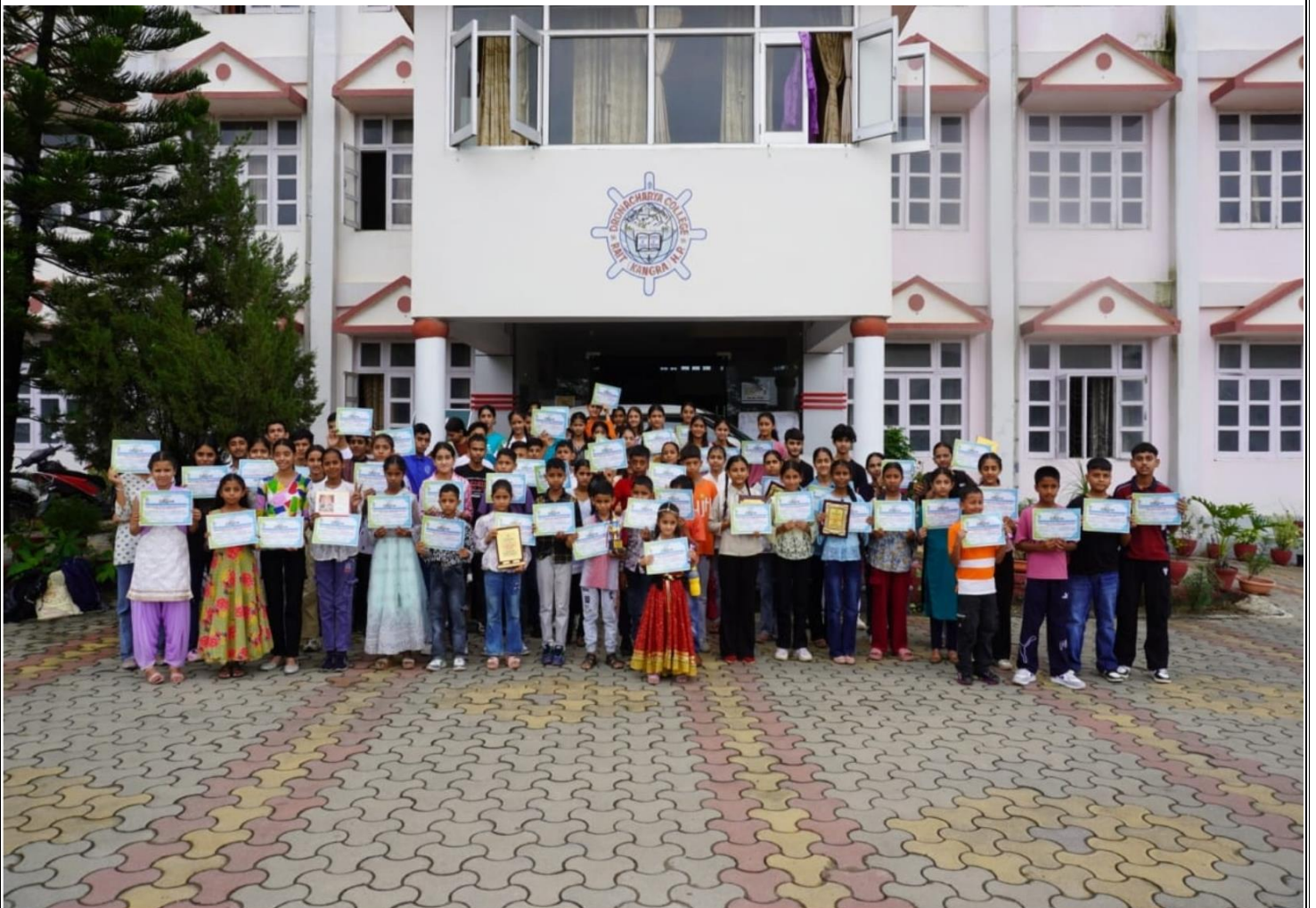
Group Photograph of all the participants