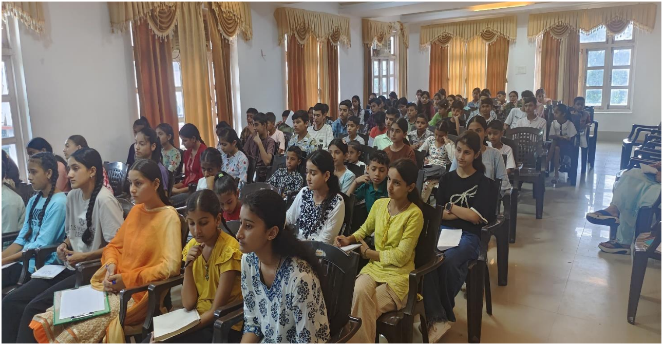
Students are attentively engaged during the session.