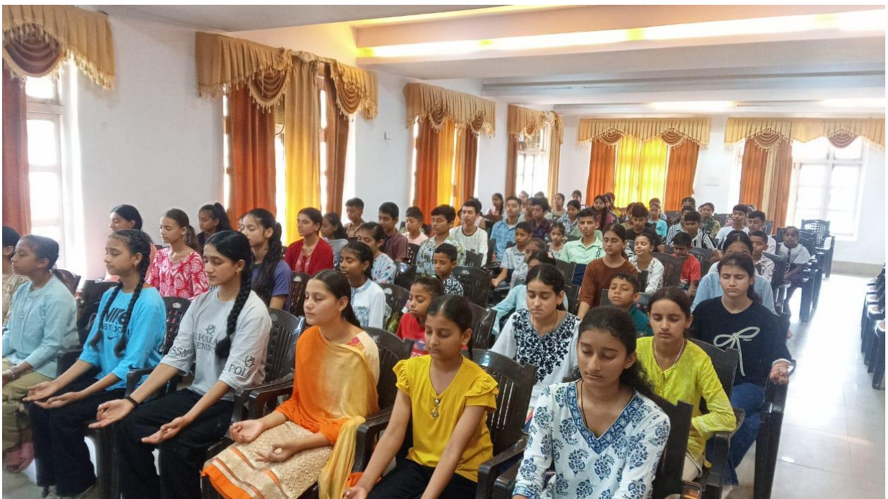
Students engage in meditation during the camp.