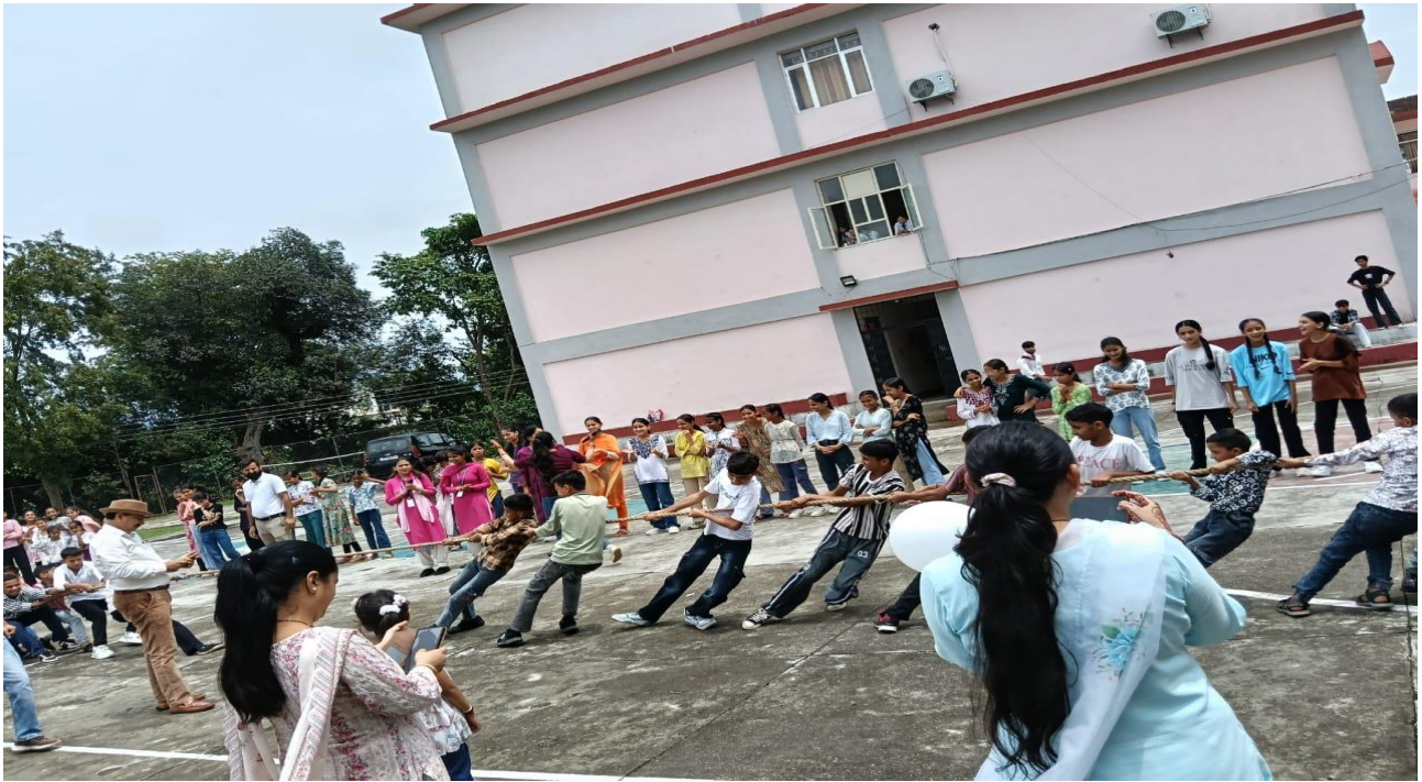
A tug of war competition was held for the senior group.