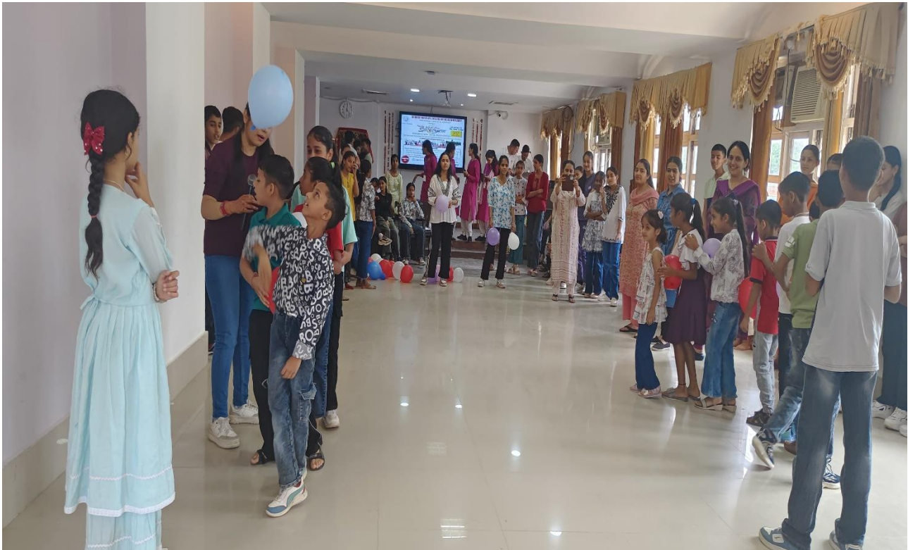
Both juniors and seniors participated in a balloon race at the camp.