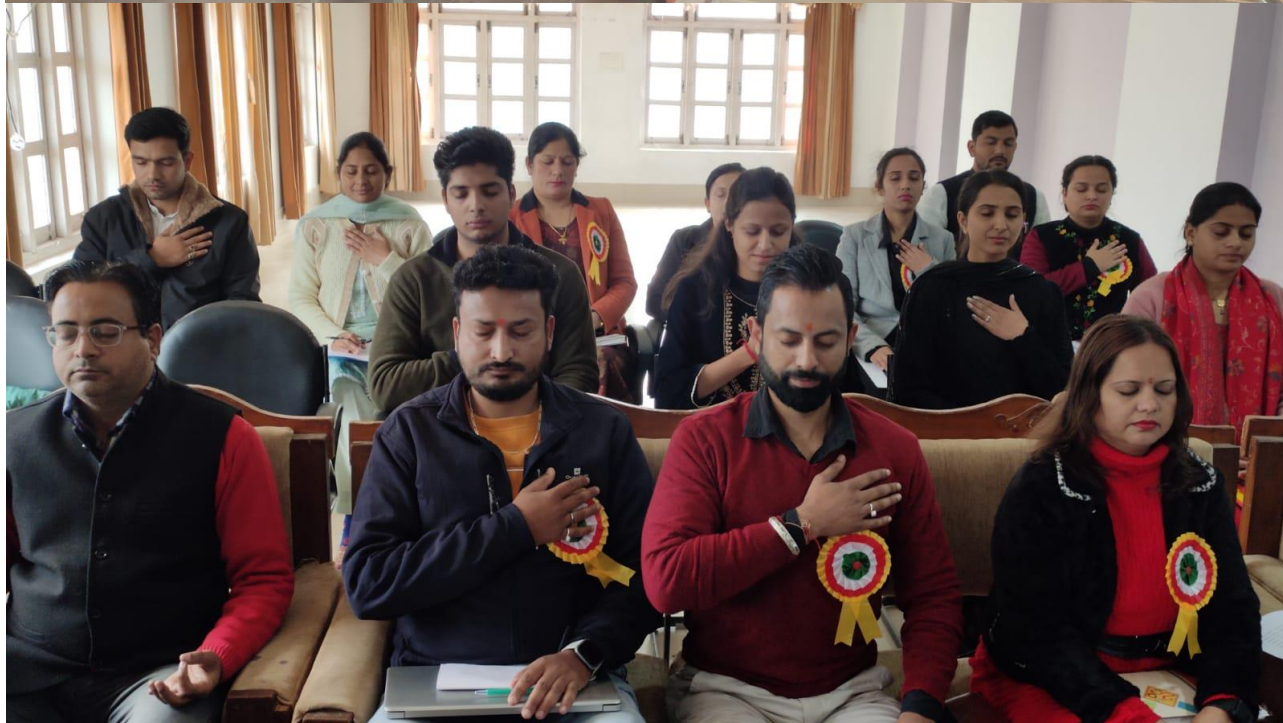
All Staff members in Affirmation position