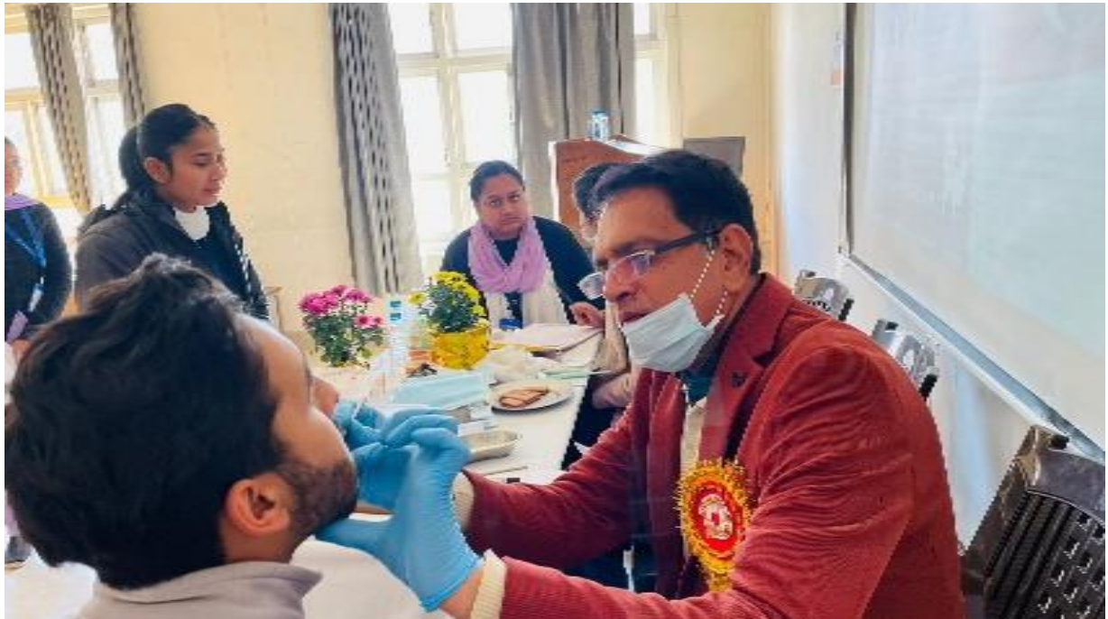
SOME SNAPSHOTS OF THE EVENT