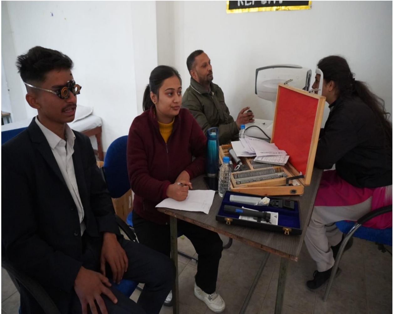
Student participating in Eye Check-up