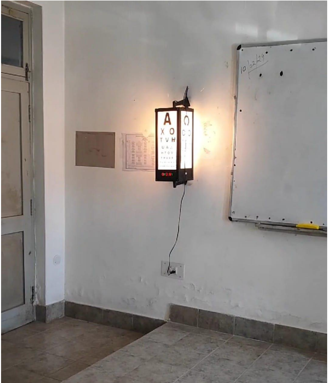
Machines used for Eye Check-up