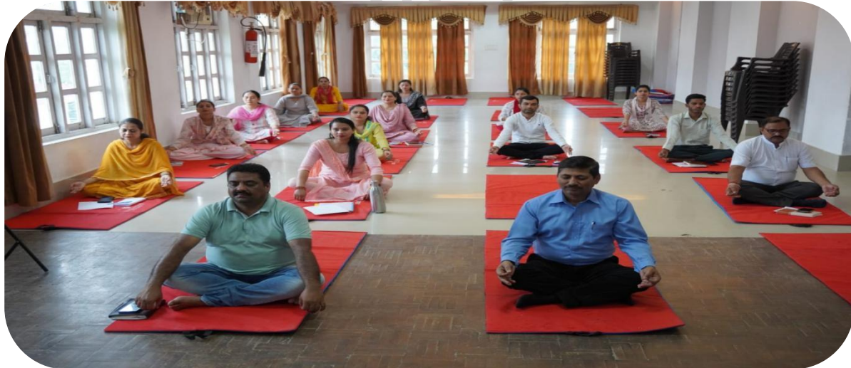
Meditation postilion all Staff members