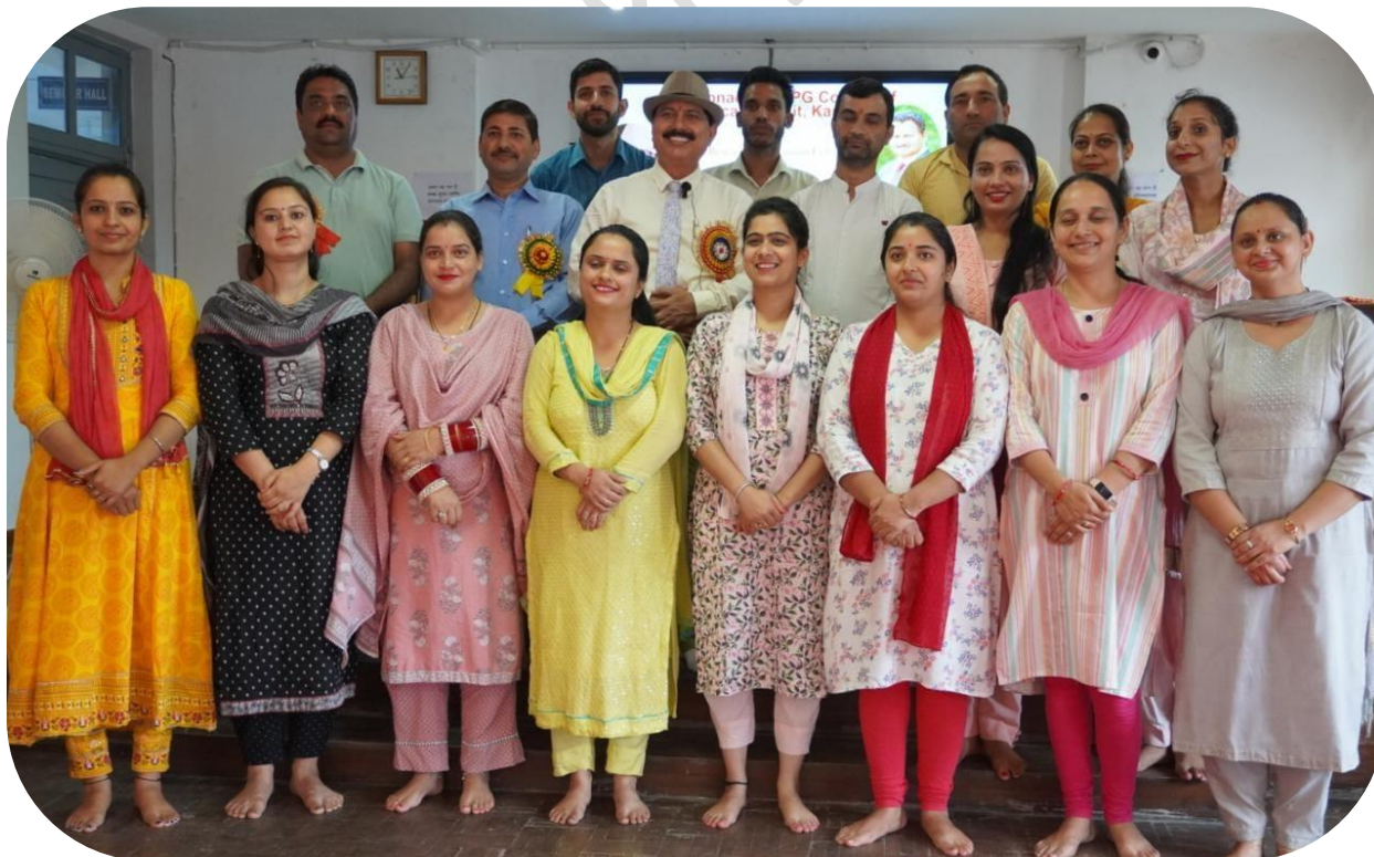
Group Photograph at the end of valedictory Session