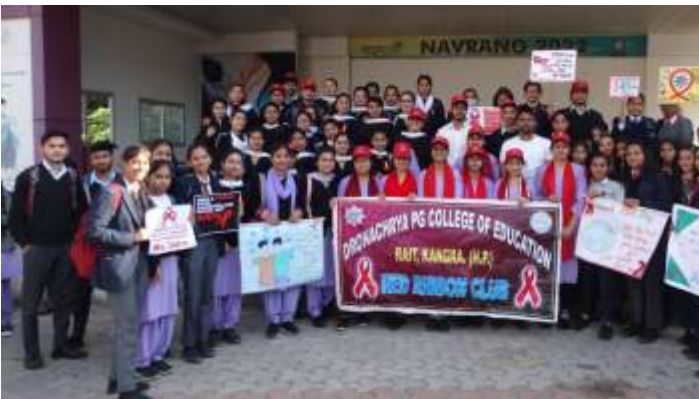
AIDS awareness campaign by Red Ribbon Club Students