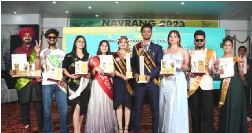
All the winners of FUSION(Modelling) Mr. and Ms. Navrang event posing for a group photograph