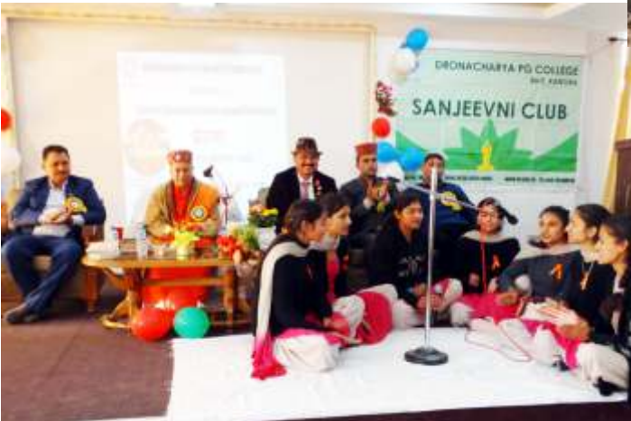
Geeta Jayanti Celebration-Sanjeevni Club