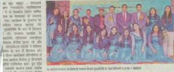
मालीबाल प्रतियोगिता में सत्यम कालेज विजेता

मालीबाल प्रतियोगिता में सत्यम कालेज विजेता। छात्रों ने एक बेहतरीन नृत्य प्रस्तुत किया।