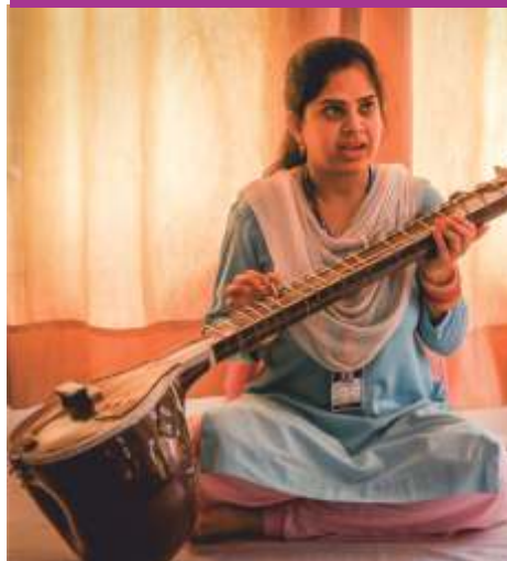
A Pupil teacher practicing a musical instrument Sitar in Art & Craft room.