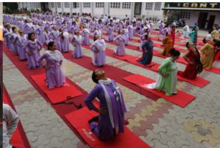
Students participating in Yoga Session organized by 6AM club