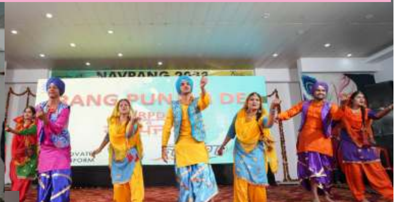
Energetic Bhangra depicting Panjabi culture