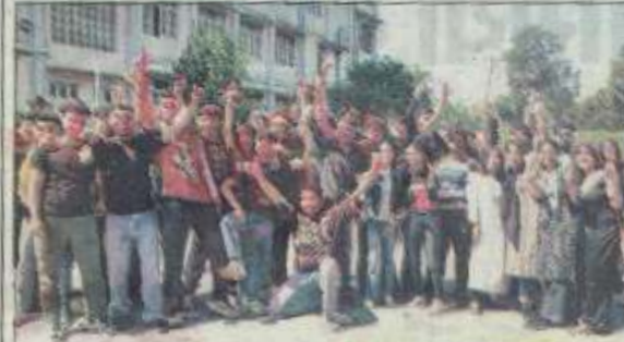
द्रोणाचार्य कालेज में धूमधाम से मनाई होली

द्रोणाचार्य कालेज में धूमधाम से मनाई होली। छात्रों ने रंग-रंगीले पानी और चूने से एक-दूसरे को रंगा।