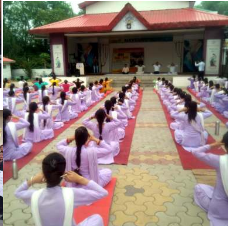
Healthy body contains healthy soul - Health and Hygiene Club