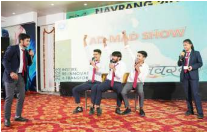
Ad Mad show by BBA Students - Manthan Club