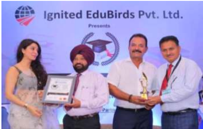
Dronacharya PG College Rait receiving the 'Best Educational Institute in Himachal Pradesh Award' by Ignited Edubirds in the prestigious NATIONAL EDUCATION AWARDS-2018