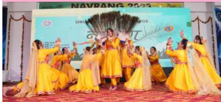
Enthralling devotional dance performance during NAVRANG