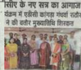
द्रोणाचार्य कालेज में वीवीए और सीसीए के नए सत्र का आगाज

द्रोणाचार्य कालेज में वीवीए और सीसीए के नए सत्र का आगाज। छात्रों ने प्रतियोगिता में भाग लिया।