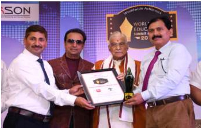
Dronacharya PG College, Rait receiving the 'Best Innovative Educational Institution in Himachal Pradesh Award' from Former HRD minister Sh.Murli Manohar Joshi and Bollywood Actor, Mr.Gulshan Grover by World Wide Achievers (leading Market research & Rating company in India) at World Education Summit and Awards -2019