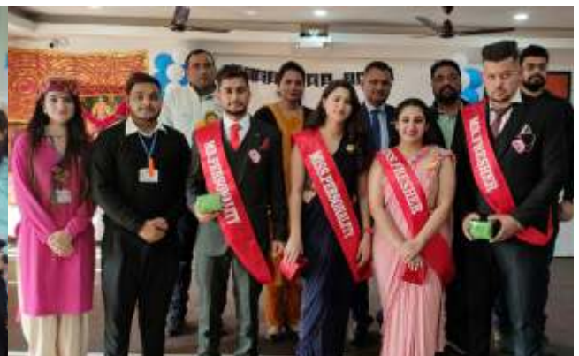
Winners of the Fresher's Party in a Group Photograph