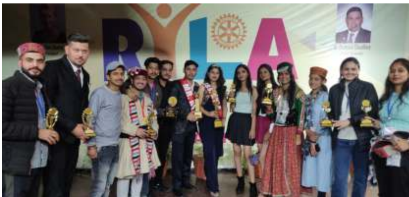
Winners of RYLA at Lovely Professional University, Jalandhar