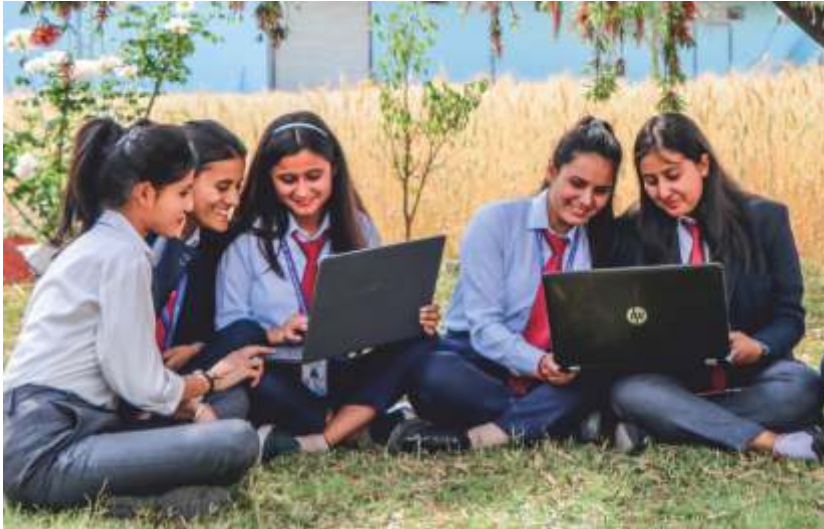
The college has a Wi-Fi campus with 24 hours Internet broad band facility and students can enjoy the service anywhere in the college.