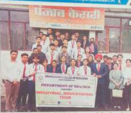
शैक्षणिक भ्रमण का आयोजन रैत में किया गया। कार्यक्रम का आयोजन रैत में किया गया।

आठवाँ वर्ष के दोहरे के दौरान द्रोणाचार्य कालेज रैत के विद्यार्थी एक शैक्षणिक भ्रमण पर निकले। कार्यक्रम का आयोजन रैत में किया गया।