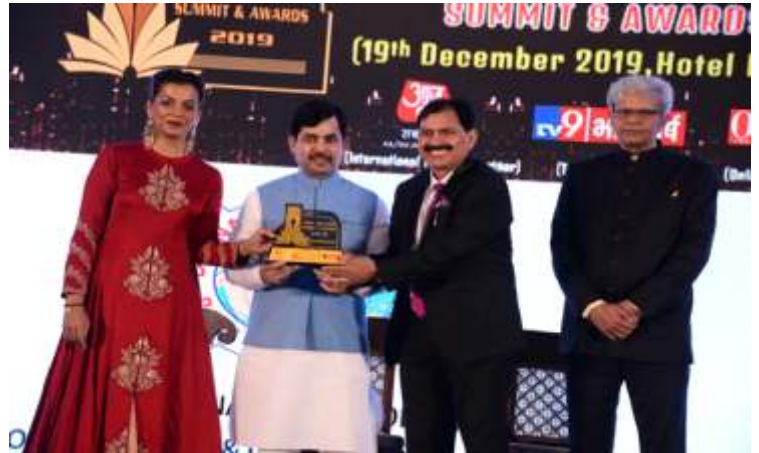
Dronacharya PG College, Rait receiving the 'Best Innovative Educational Institution in Himachal Pradesh Award' presented by Shah Nawaz Hussain, Former Cabinet Minister of India, World Wide Achievers at World Education Summit and Awards -2019