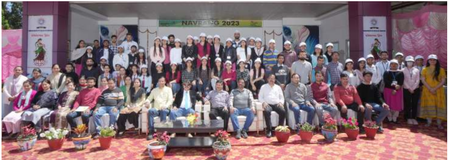
Management, Principal, HODs , Faculty and students posing for a group photograph.