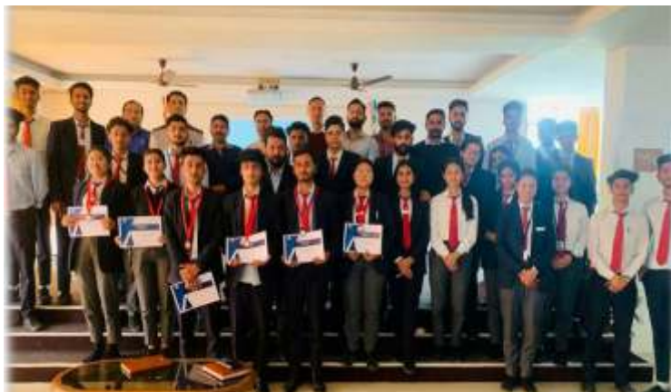
Web site making competition participants BCA-Swat Club