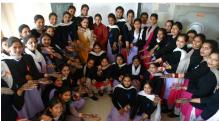
Mehndi competition at Talent Hunt by B.Ed. Students