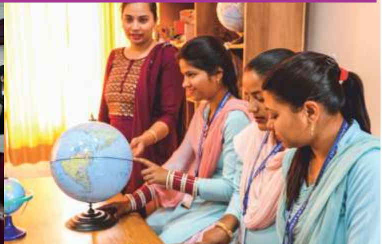
Pupil teachers learning through the use of teaching aids in Social Science lab.