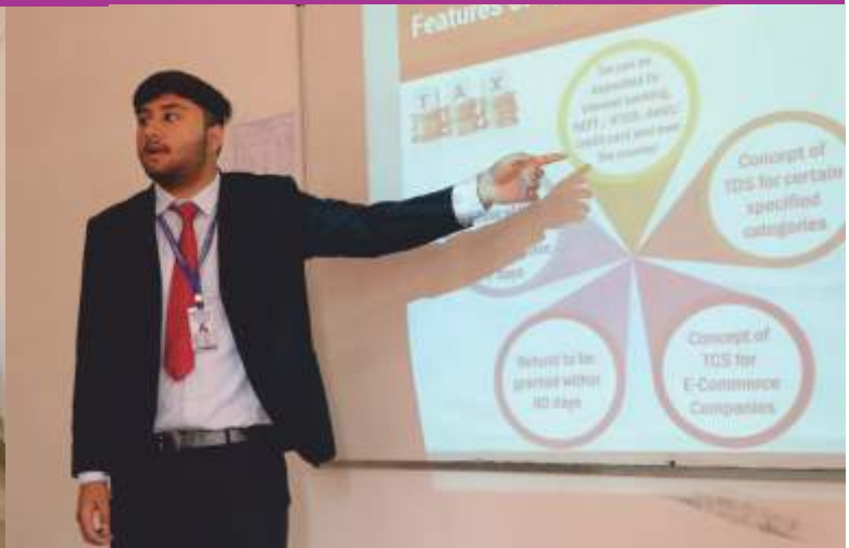
To boost up the confidence and presentation skills, the students of BBA/BCA are giving presentations in the classrooms using the latest IT tools.