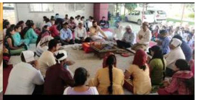
Inaugural of BBA/BCA Session 2022-25