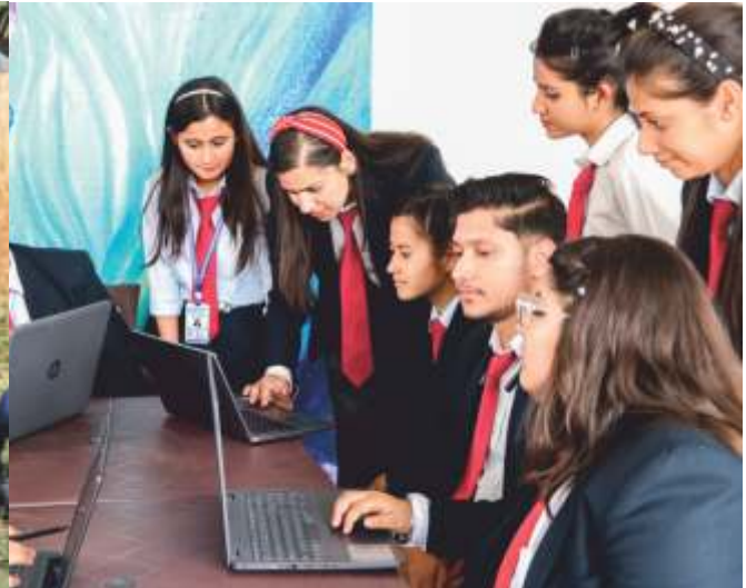
Special arrangements have been made for the students for group discussions in the college.