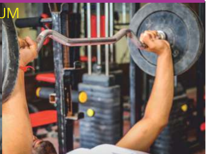
Students are developing their Physical strength and stamina in the college's well-equipped Gymnasium.