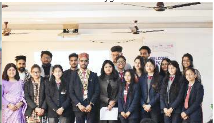
Installation of Rotaract Club President