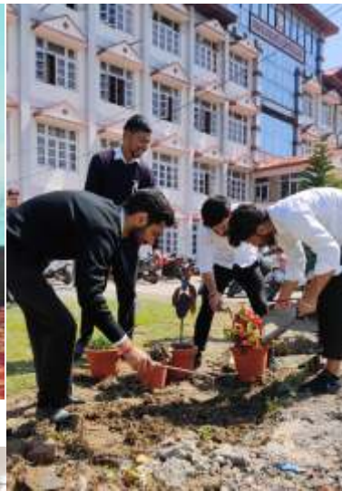
Campus Beautification by Environment Club Students