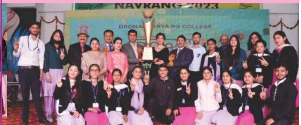
Best House- Kalam House Session 2022-24 (B.Ed.)