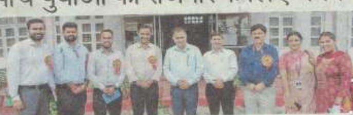
पांच युवाओं का रोजगार के लिए चयन

पांच युवाओं का रोजगार के लिए चयन। छात्रों को रोजगार के अवसर प्रदान किए गए।