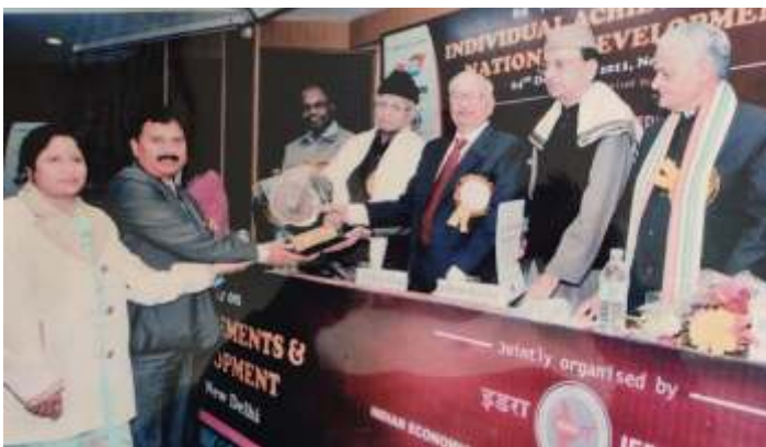
Dronacharya PG College receiving 'Shiksha Bharti Puraskar' by All India Achievers Foundation and received the award from former Chief Election Commissioner T.S Krishnamurti and Governor of Sikkim.