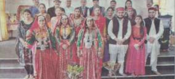
छात्रों ने जन्मदिन पर पौधारोपण करने का लिया संकल्प

छात्रों ने जन्मदिन पर पौधारोपण करने का लिया संकल्प। इस अवसर पर छात्रों ने अपने-अपने जन्मदिन पर एक-एक पौधा रोपित किया।