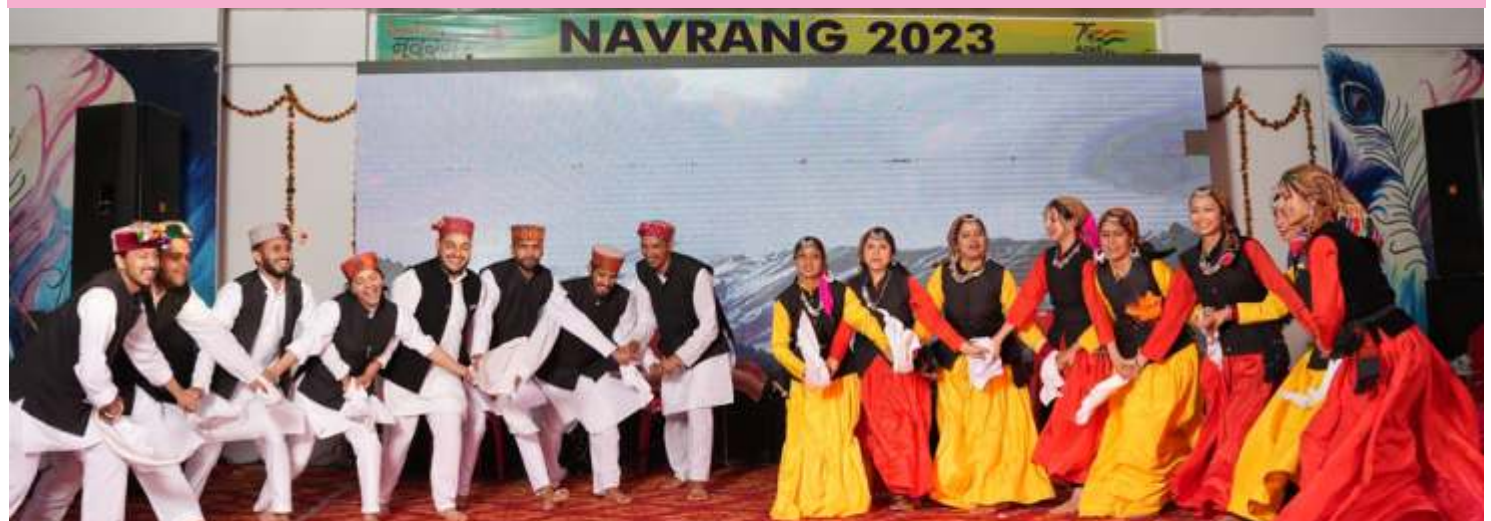
Mesmerising Pahari Nati during Navrang-2023