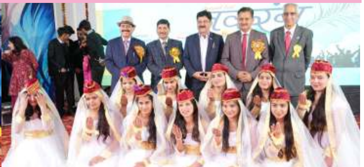
Qawwali performers posing for photograph with the members of the management and guests of honor.