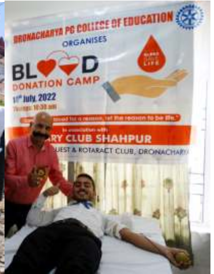
Blood Donation camp organised by Sang Bequest Club Students