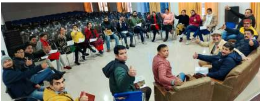
Group photograph during Faculty Development Programme