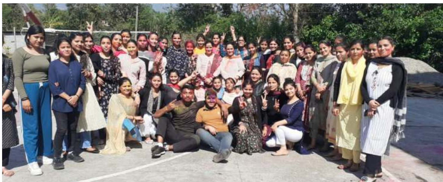
Holi celebrations by College students organized by SCA