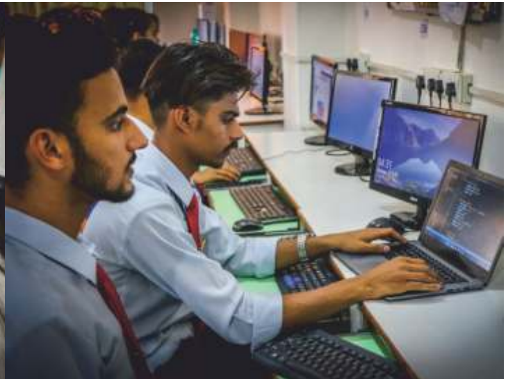
The campus has well equipped computer laboratory accessible to the students during the college hours with advanced infrastructure in terms of hardware and software to cater the requirements of the students, teachers and the curriculum.