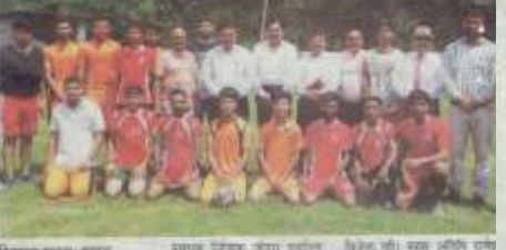
वॉलीबाल प्रतियोगिता में छापी वीसीए की टीम

वॉलीबाल प्रतियोगिता में छापी वीसीए की टीम। छात्रों ने एक बेहतरीन प्रदर्शन किया।