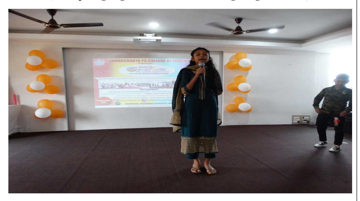
(Participants introducing themselves at beginning of the event)