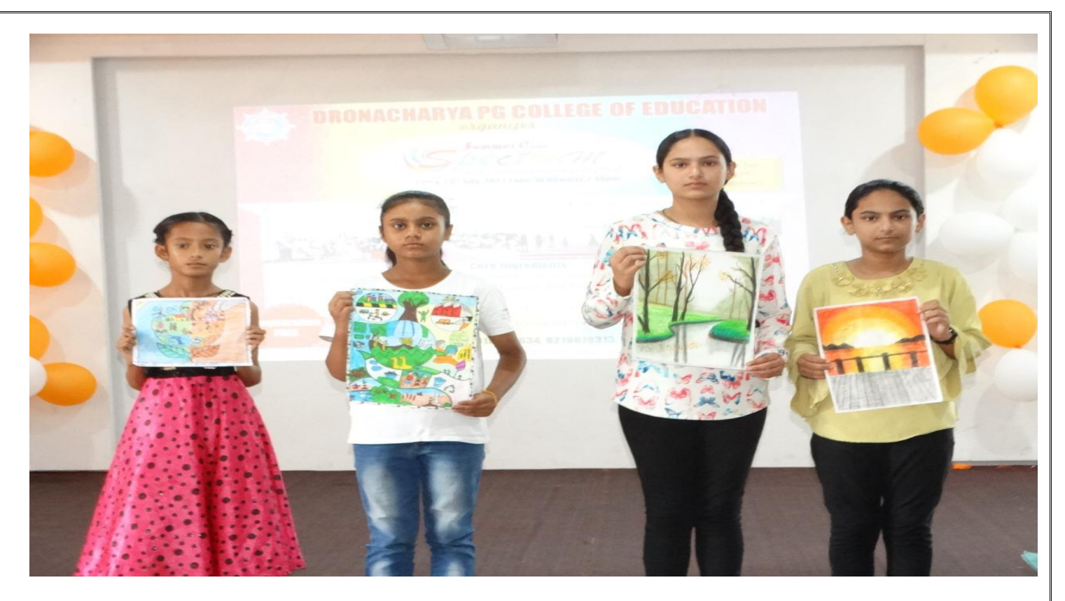
(Glimpses of Paintings made by Students)