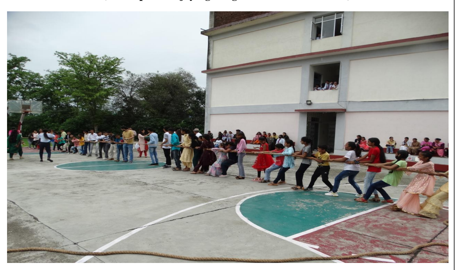
(Participants enjoying the game of Tough of war)