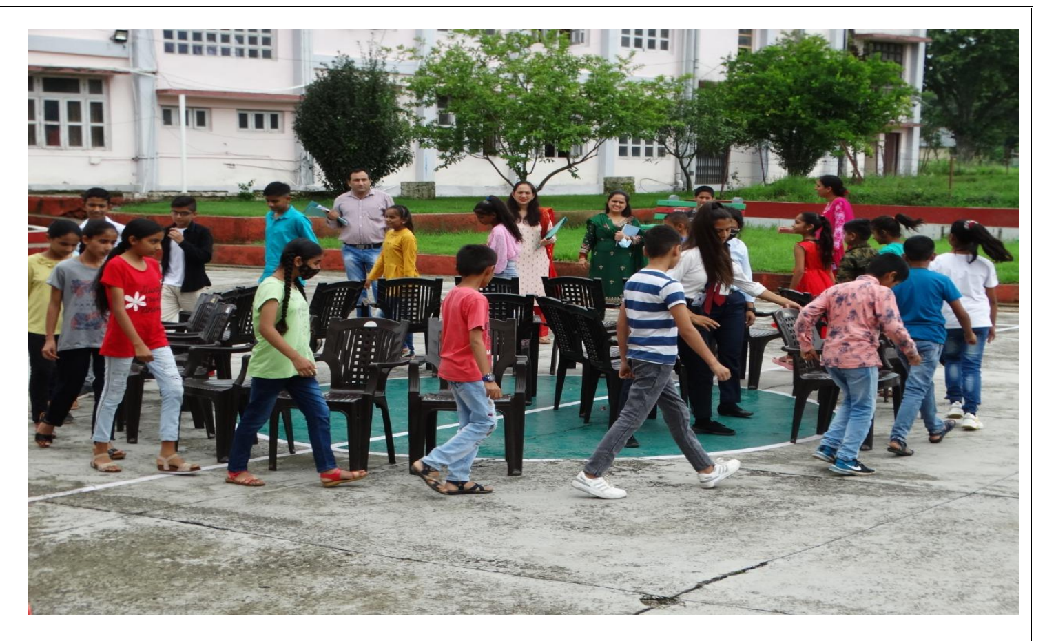
(Participants enjoying the game of Musical Chairs)