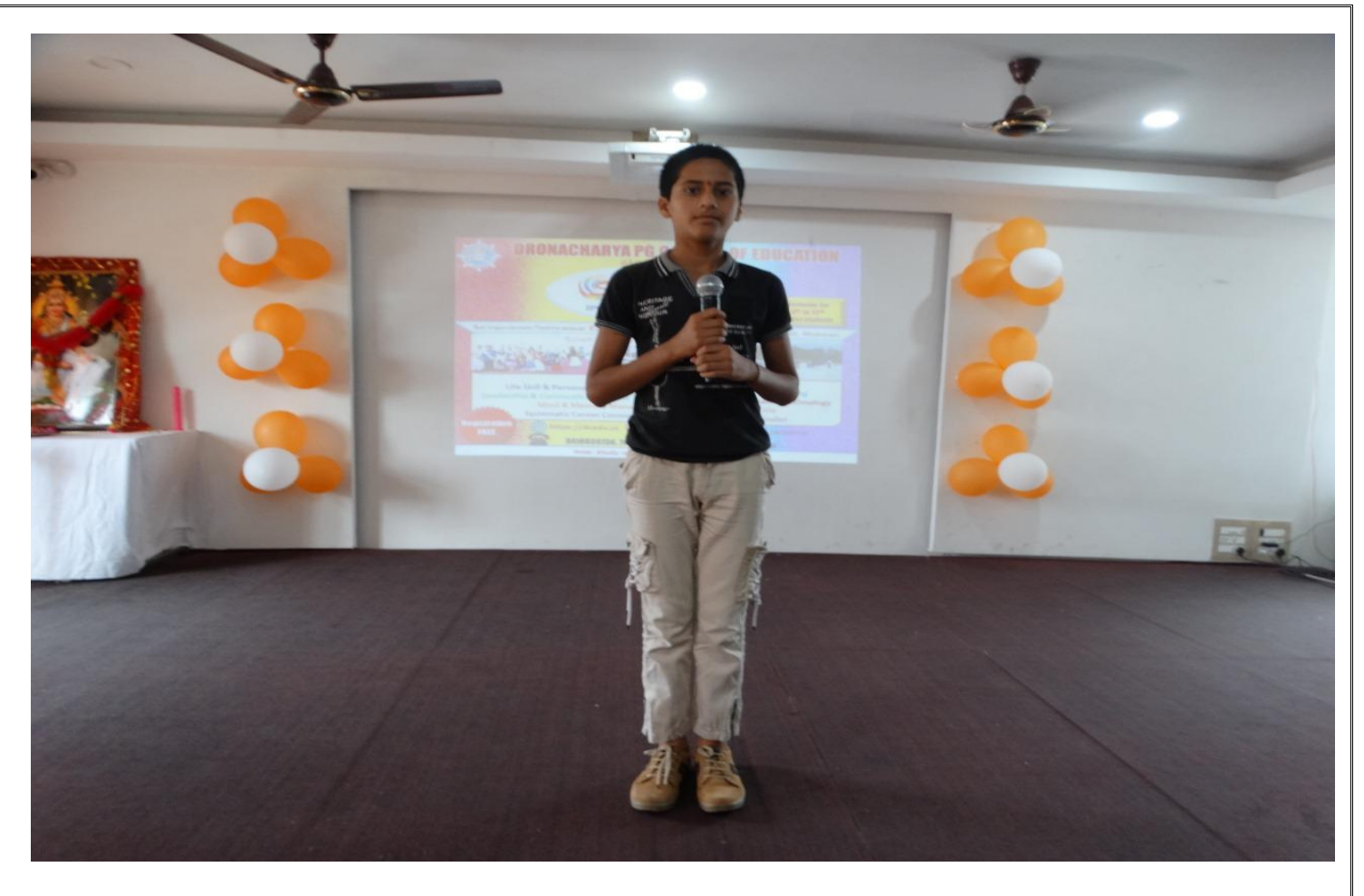
(Participants giving their Introduction at the beginning of the event)