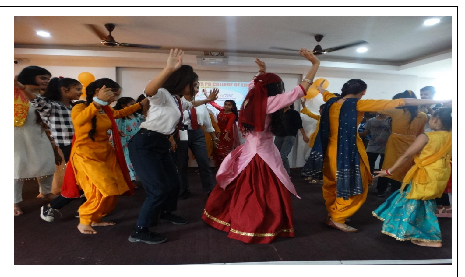
(Group Dance Performance of Participants)