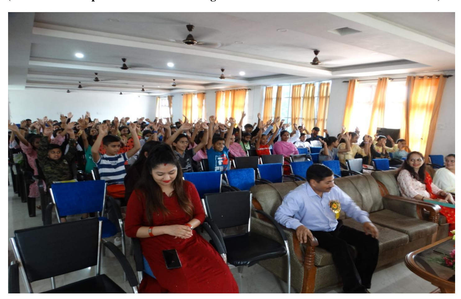
(Students responding to Resource Person with full Heart and soul)