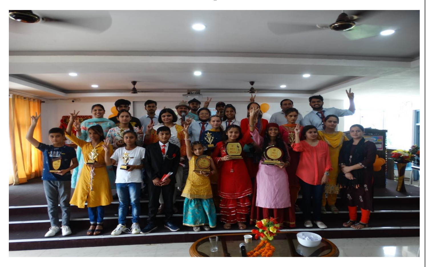
(Group Photograph of all the participants at the end of the event spectrum-2022)