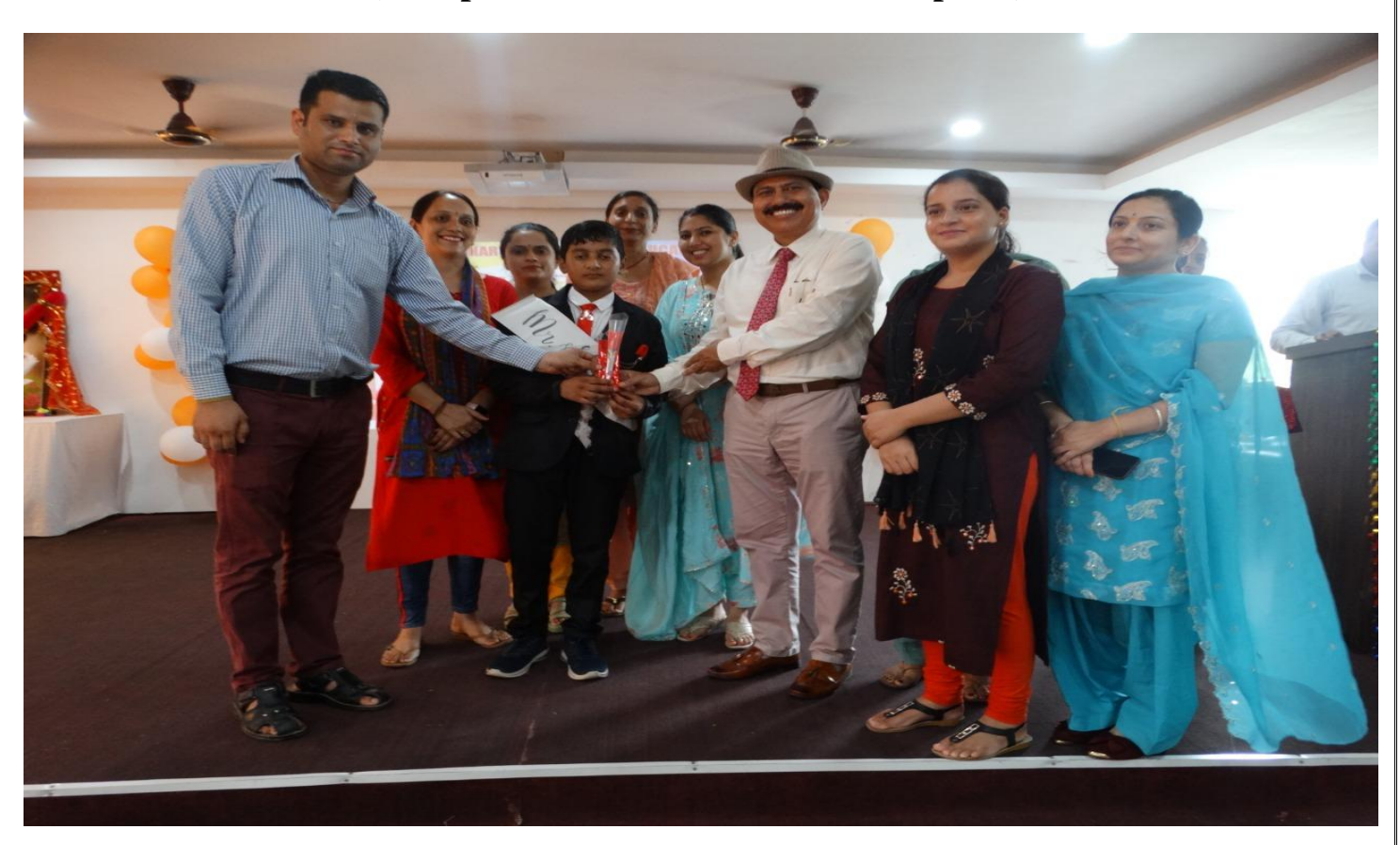
(Chief Guest facilitating participants during valedictory session)