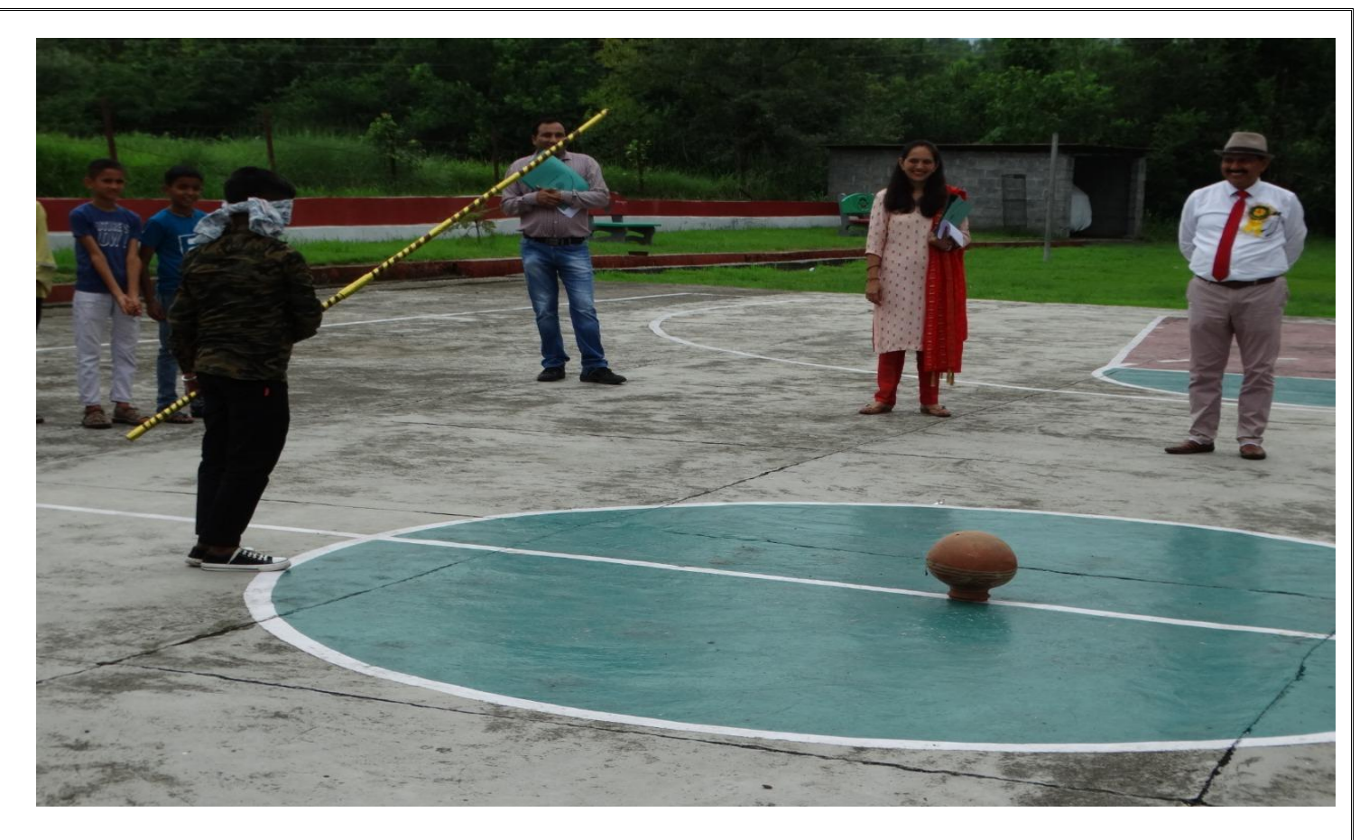
(Participants enjoying Matka Fhod Game)