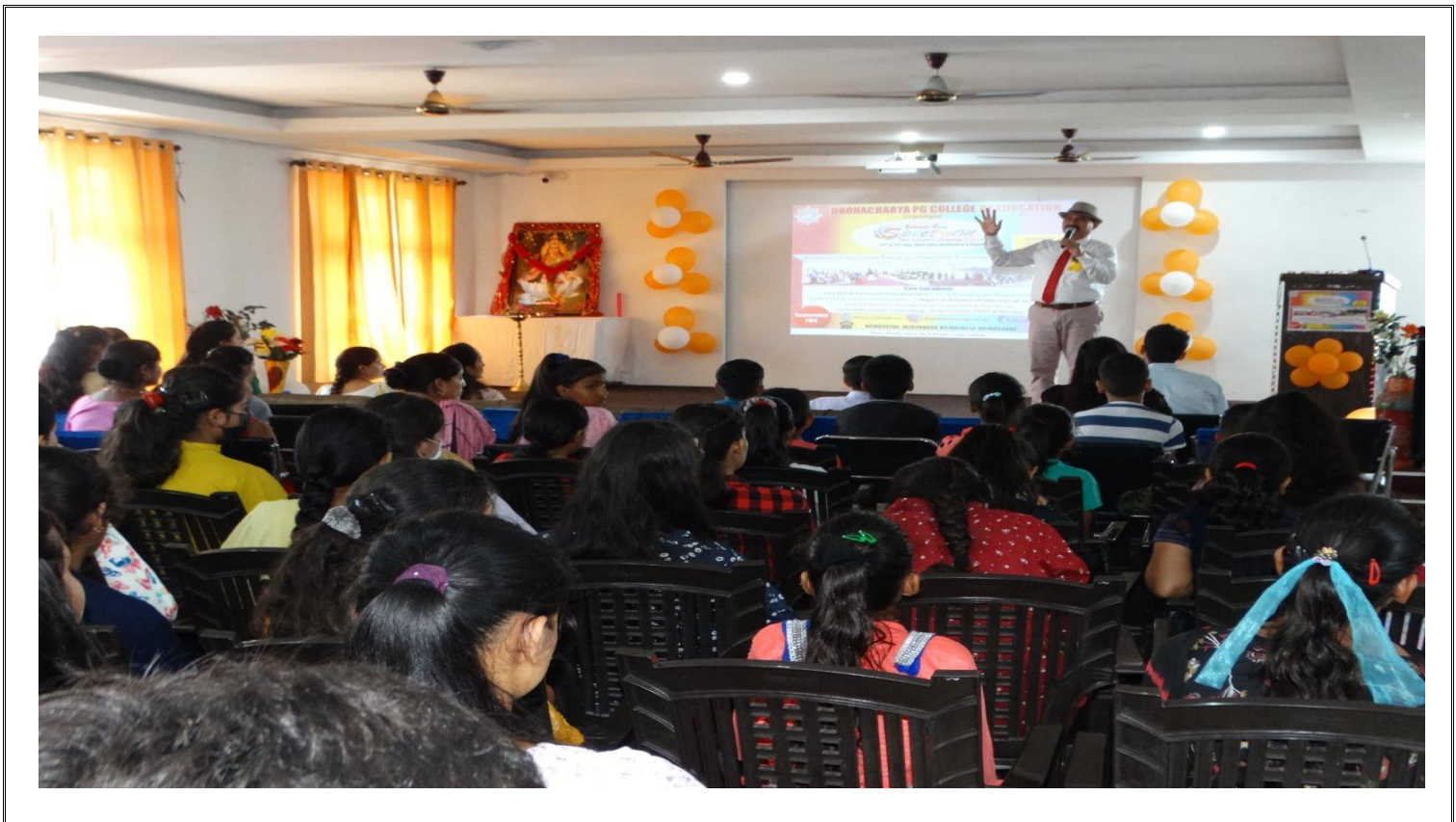
(Chief Guest of Spectrum 2022 interacting with students with full Josh and Enthusiasm)