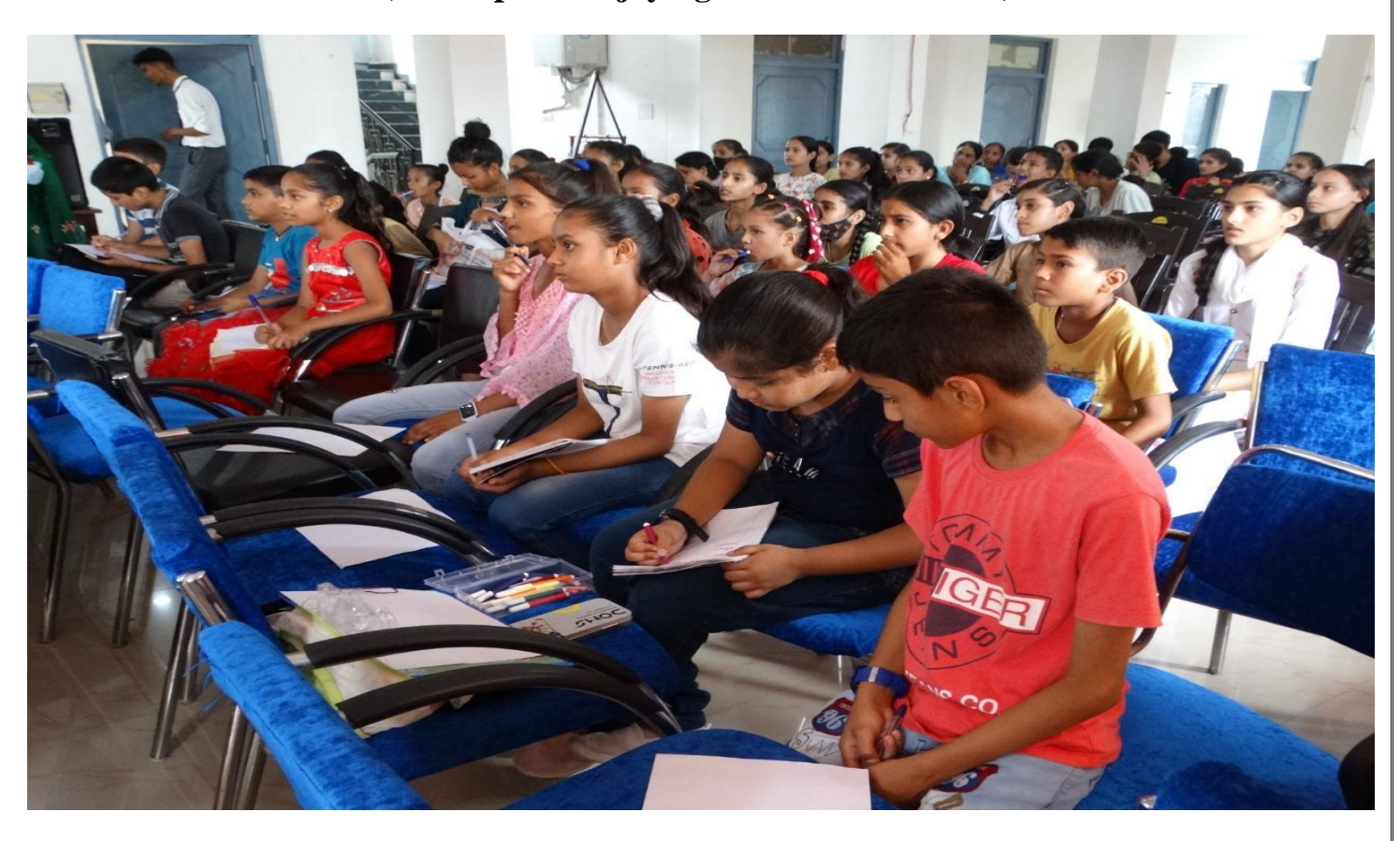
(Participants showing their Creativity by drawing the beautiful sketches)