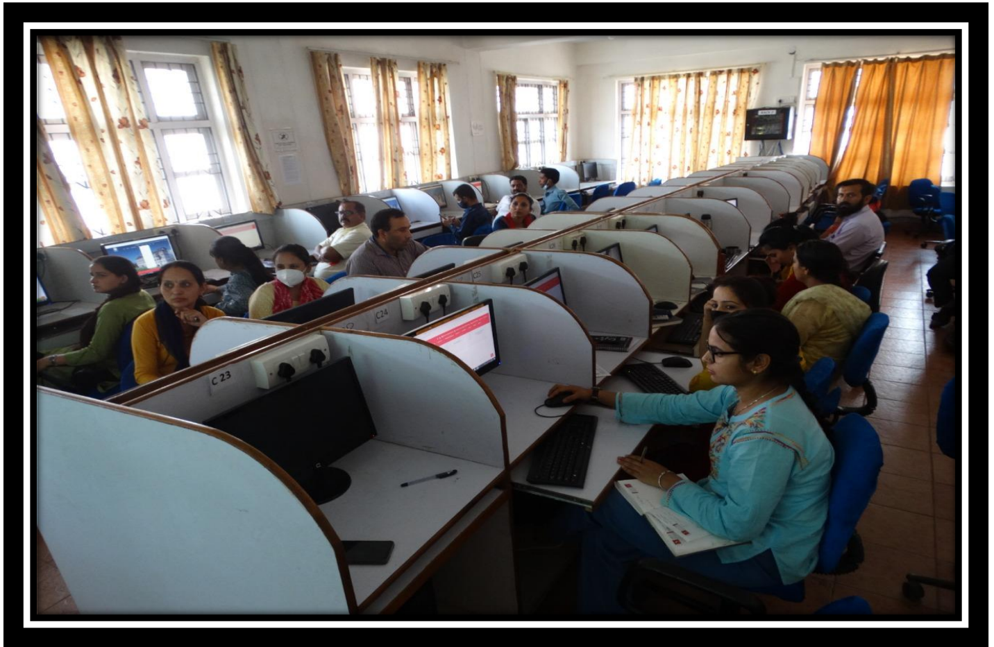
Utilisation of ICT Lab by All the Faculty Members

Organized by Training and Development Cell In collaboration with IQAC