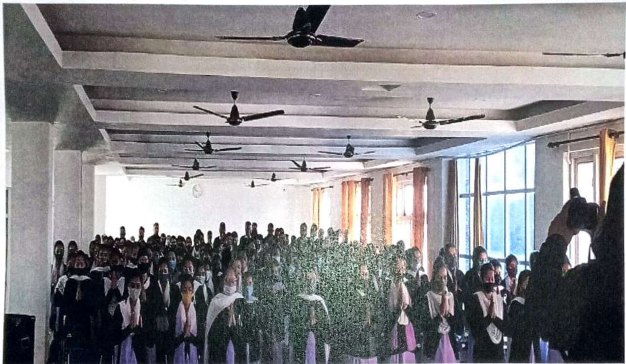
Pupil teachers singing morning prayer during Morning Assembly