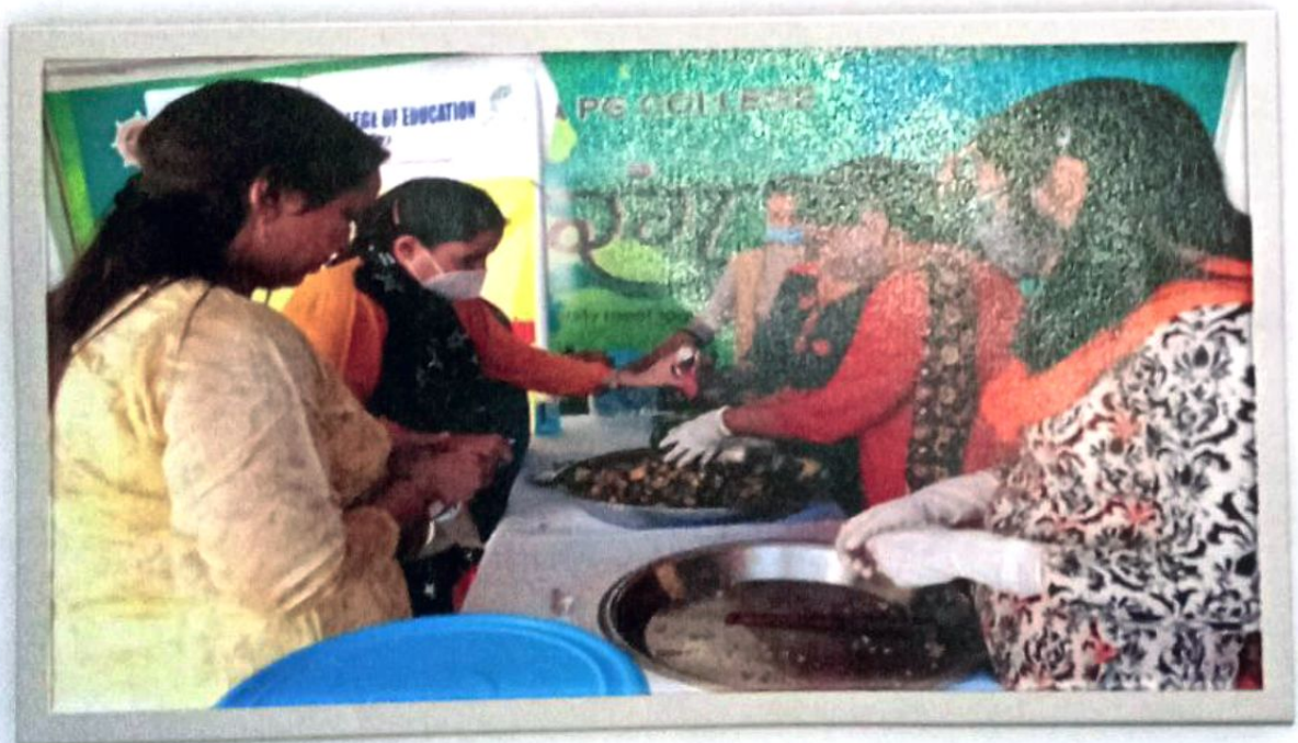
Pickle making during the VENDEL Activity