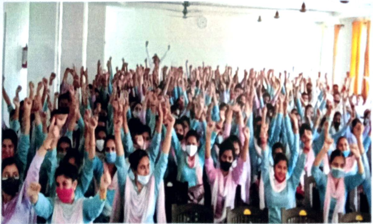
Students participating in the empowerment activity during morning assembly