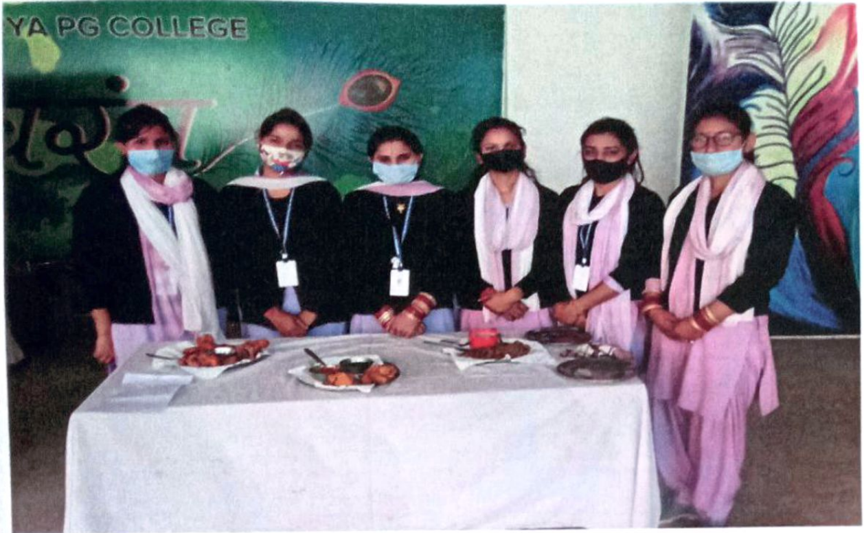
Girls showcasing their culinary skills in cooking competition of VENDEL activity