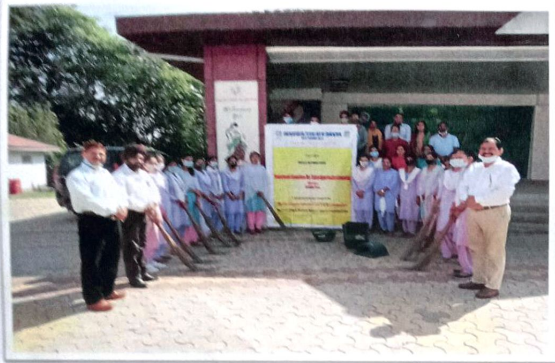
Swachh Bharat cleanliness 'Swachhta Abhiyan' during VENTEL Activity

Principal, Dronacharya College of Education Rait (Kangra) H. P. - 176208