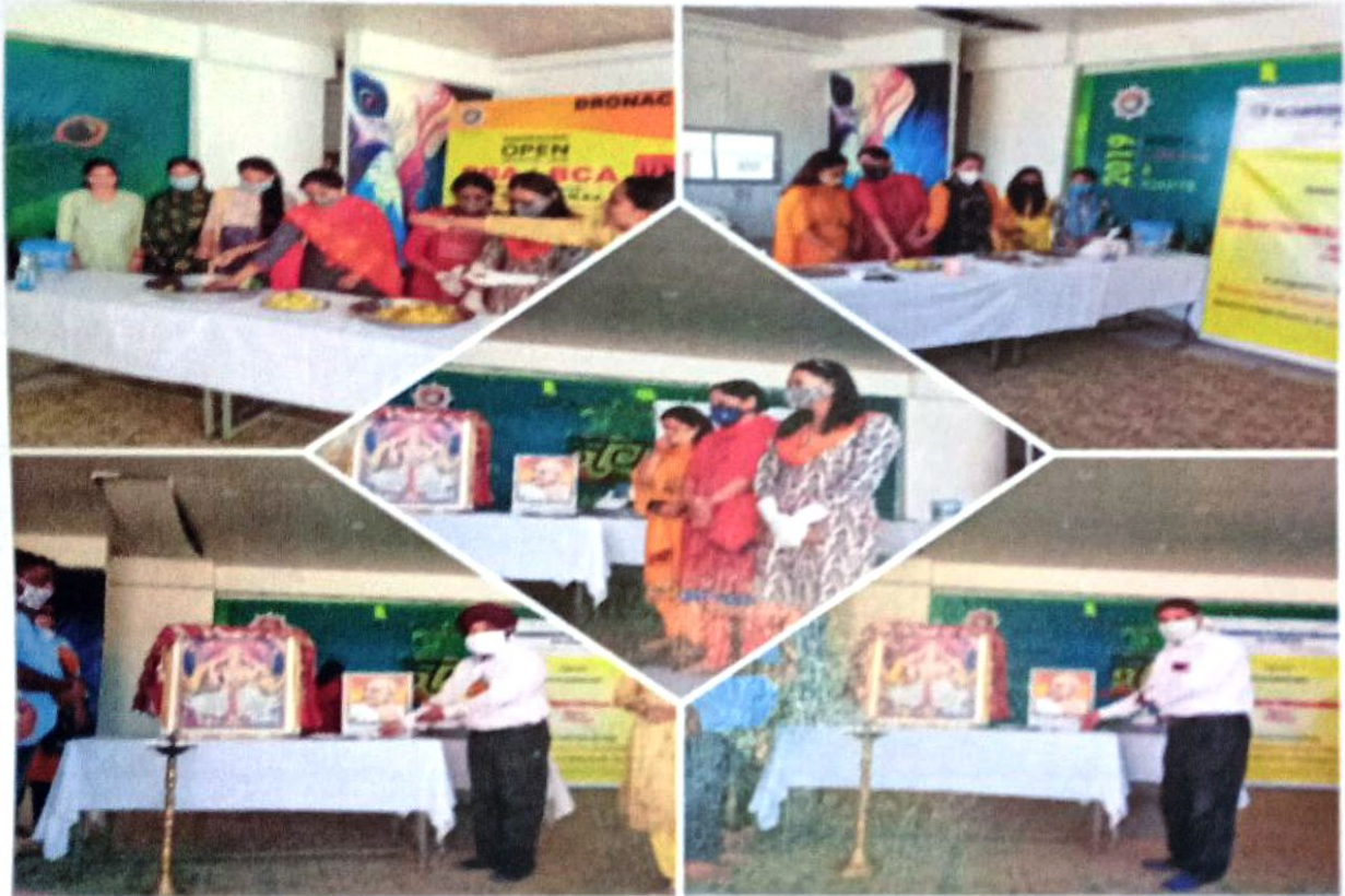
Inauguration of Nai Talim Vocational Education Nai Talim Experiential Learning and Pickle making competition

TITLE: Vocational Education Nai Talim Experiential Learning (VENTEL)