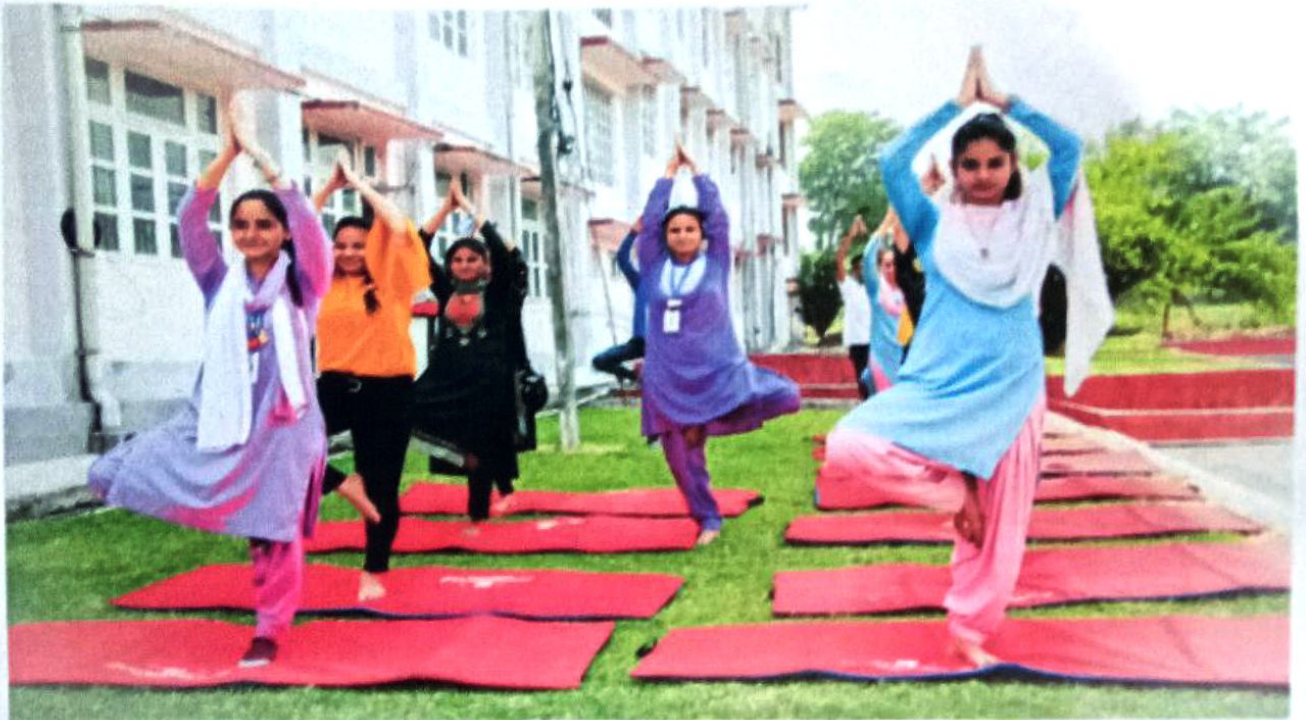
Yoga and meditation session in the morning