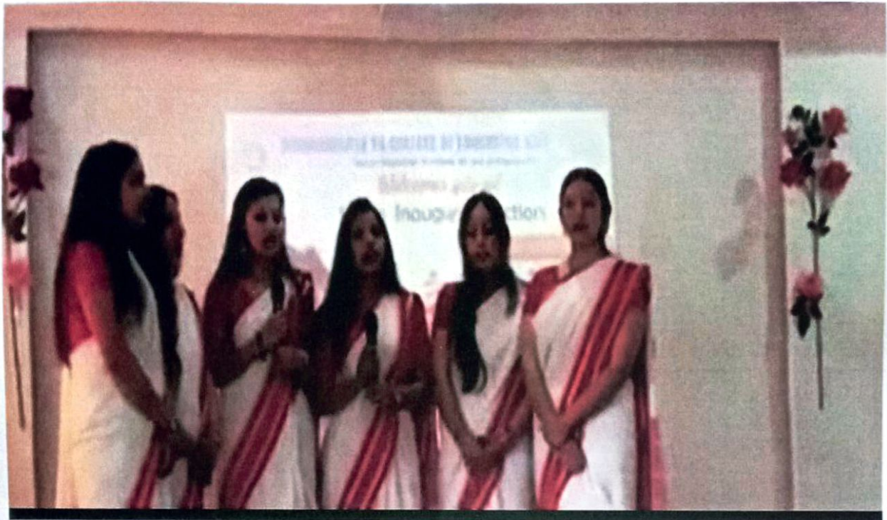
Pupil teachers singing Saraswati Vandana during Morning Assembly