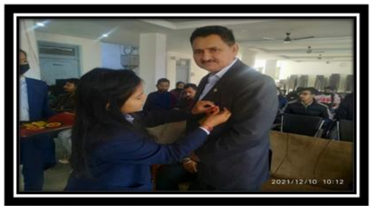
(Girls of BBA department pin up badge to Managing Director Sir)