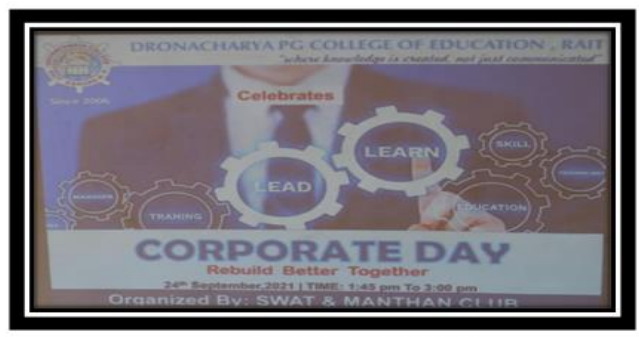
(Slide with theme of corporate day)