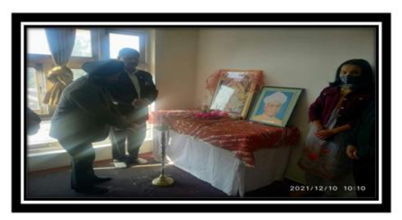
(Lamp lighting ceremony with Saraswati Pooja)