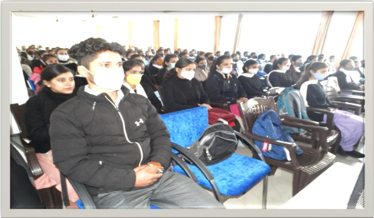
Students take interest to learn fast calculations