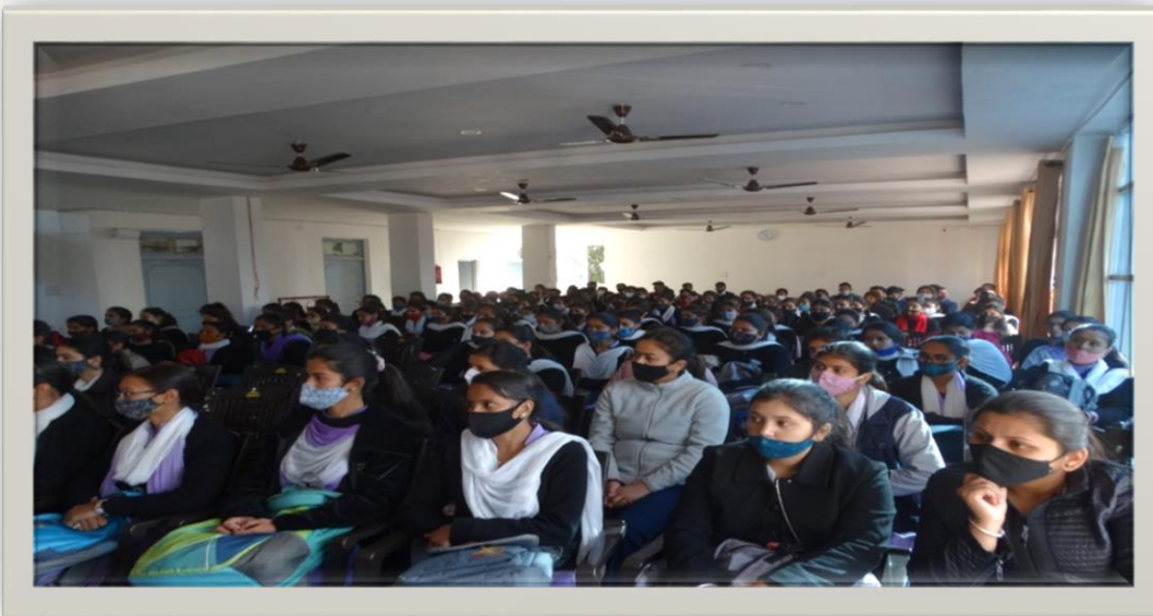
Students listen the Resource Person