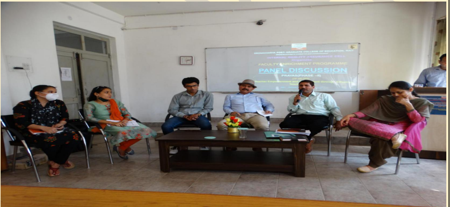
Panel Discussion for clearing doubts and queries regarding to delivered skills