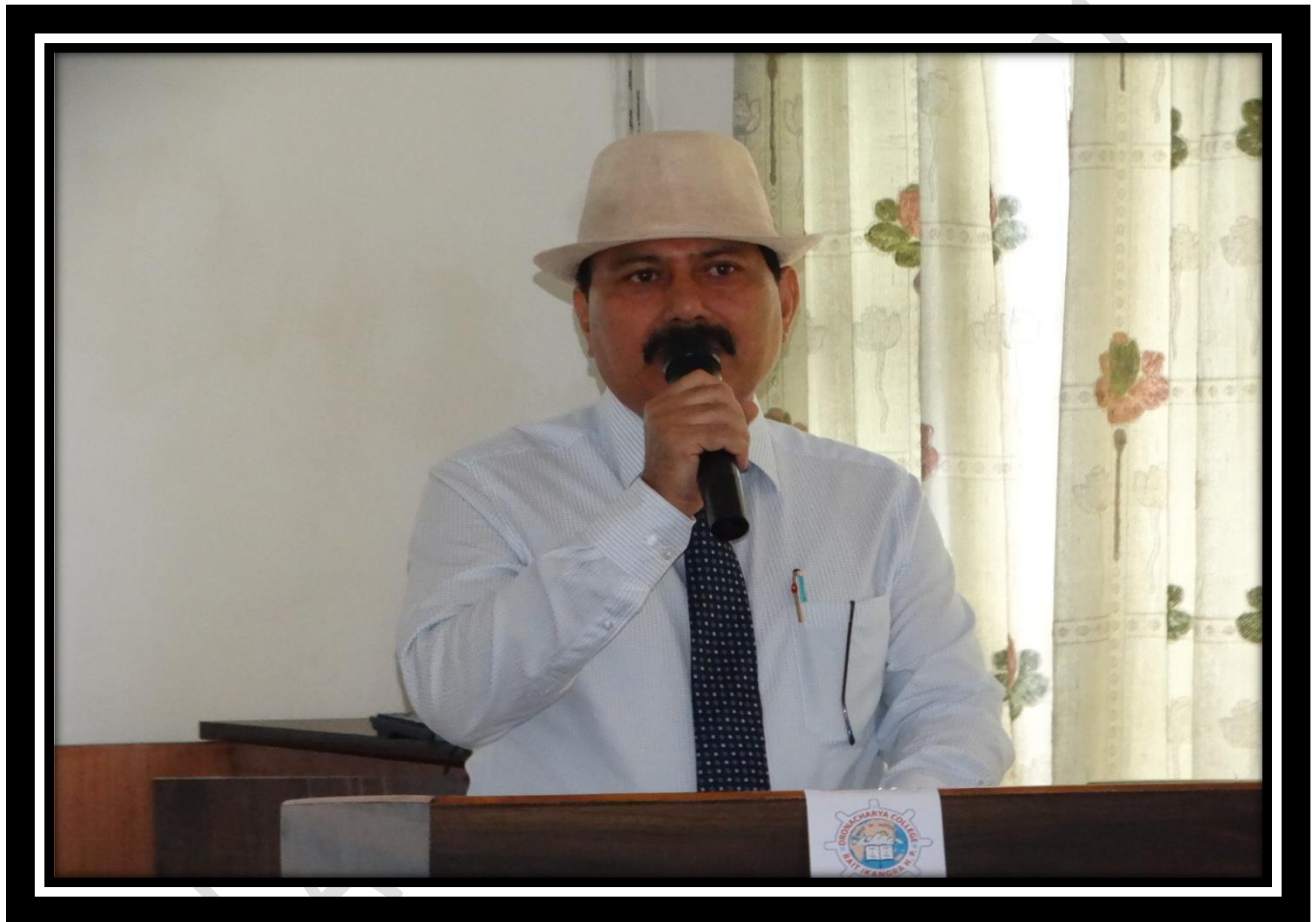
Executive director shared his views

Executive director while addressing the M.Ed. students shared his views regarding how to explore their potential in research. He also encouraged & motivated the M.Ed. students for the higher studies and to give 100% for the qualitative research which enhances our society.