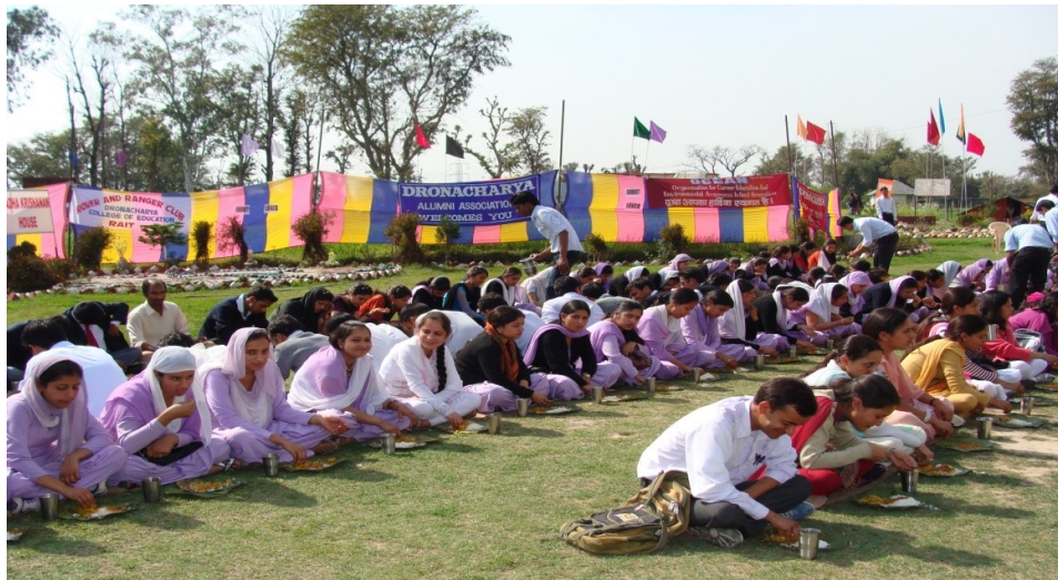
A scene of Community Lunch in the College