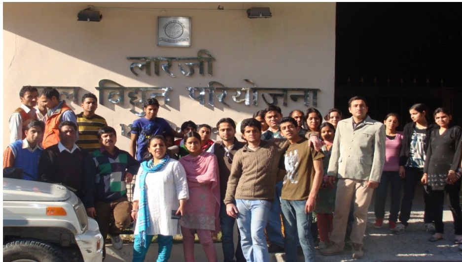
Students widening their Mental Horizons during Educational Tour