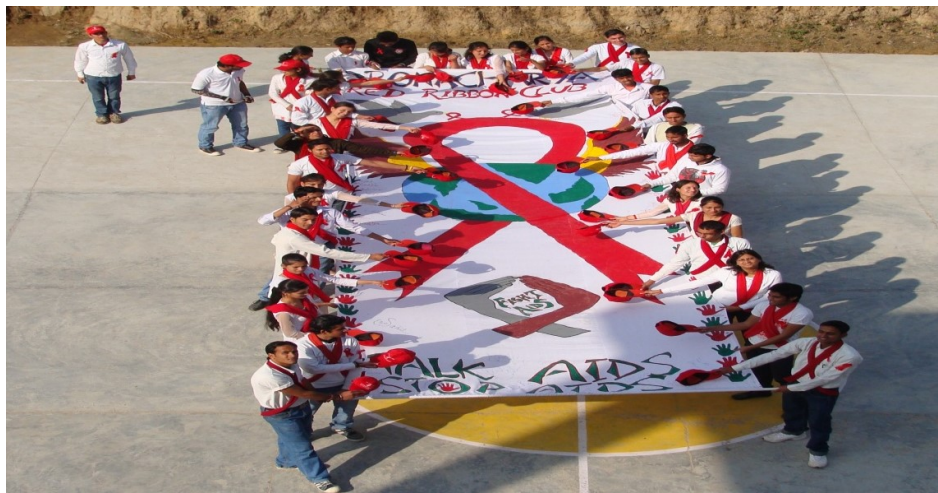
Mega Canvas made by Red Ribbon Club on AIDS Awareness