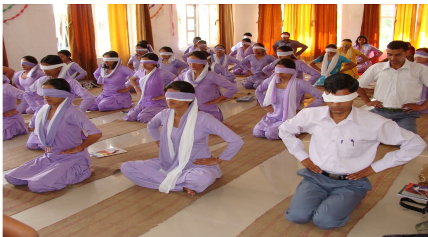
Students in Art of Living workshop