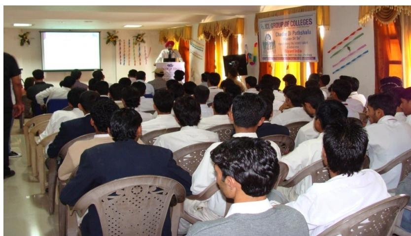
A Guest Talk to enrich the students with noble thought