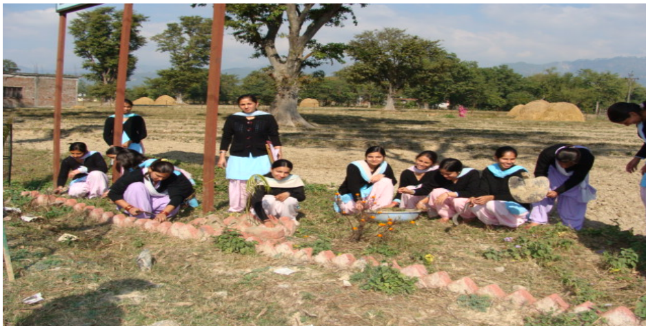
Cleanliness Campaign by the Students