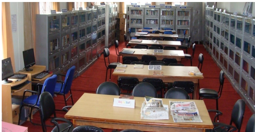
Augmented Facilities in the College Library