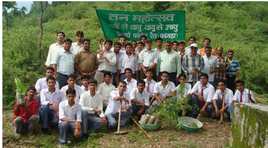
Striving for the Cause of Survival by saving the environment