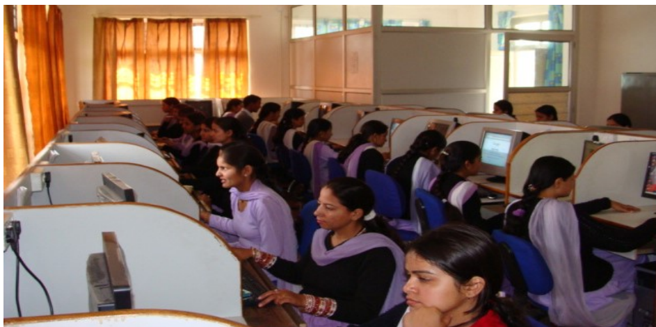
Students in the Computer Lab

The campus was made Wi-Fi enabled with round the clock broadband connectivity and 15 new computers were added to the computer lab. The extensive use of computer by the faculty and students is an indication of the good computer savvy environment of the college.