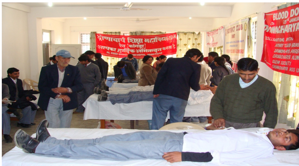
A Blood donation Camp