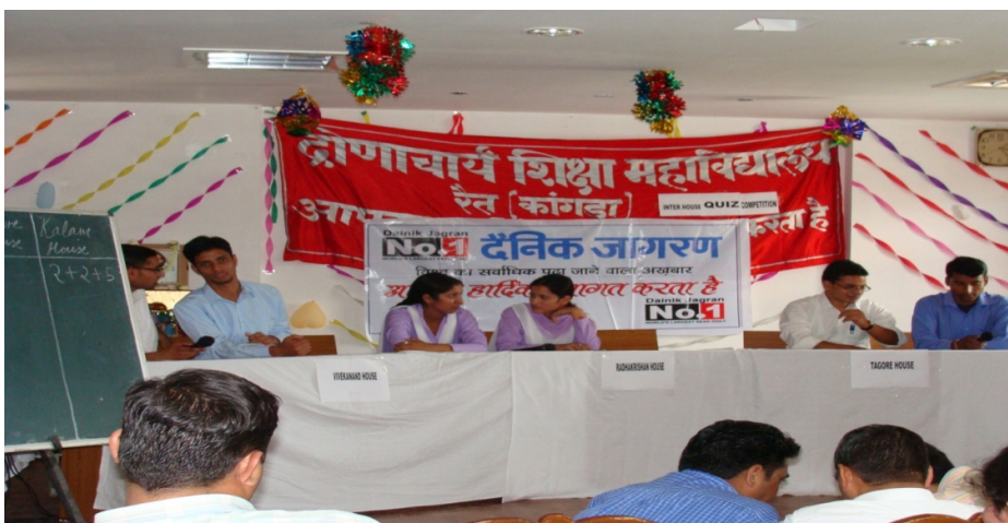
A talent Hunt Quiz Competition organised by Dainik Jagran Newspaper