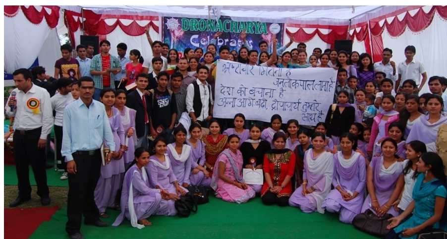
Standing for the Cause of Corruption