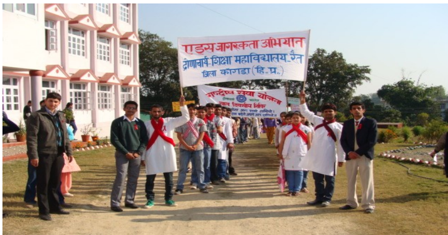
AIDS Awareness Drive by Red Ribbon Club