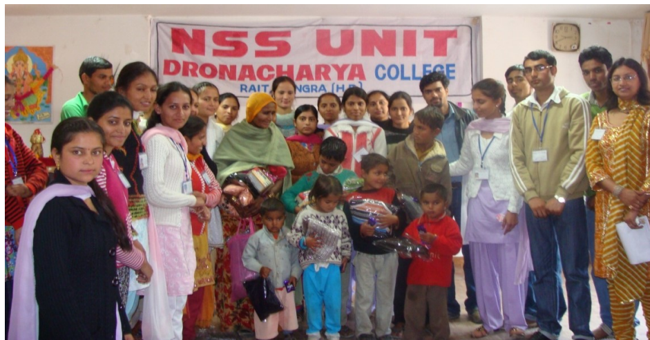
Community Service by NSS Unit