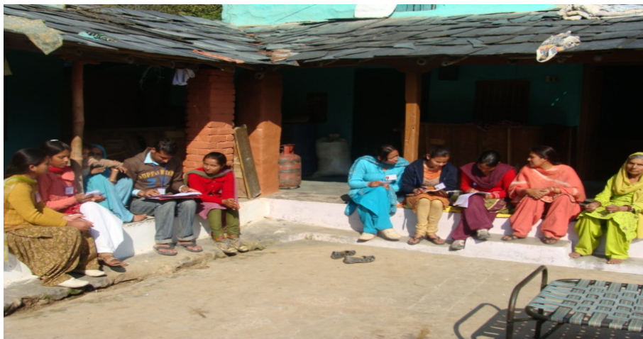
Students visiting the Rural Areas during Social Survey by NSS Unit