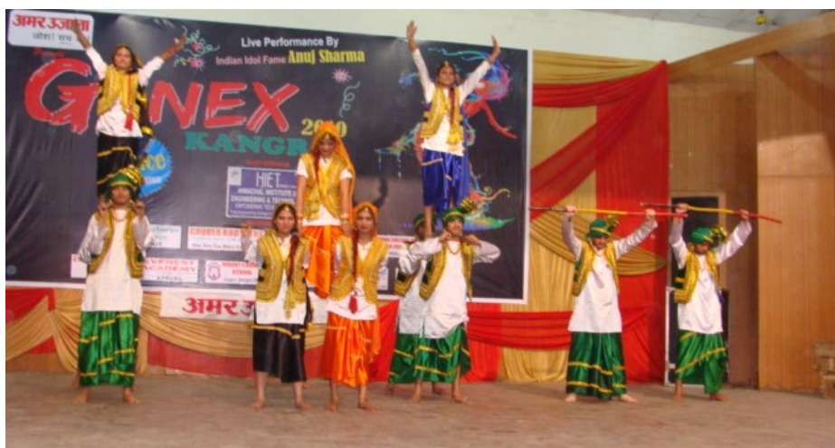
Students performing during State Level Cultural Extravaganza organized by Amar Ujala Newspaper