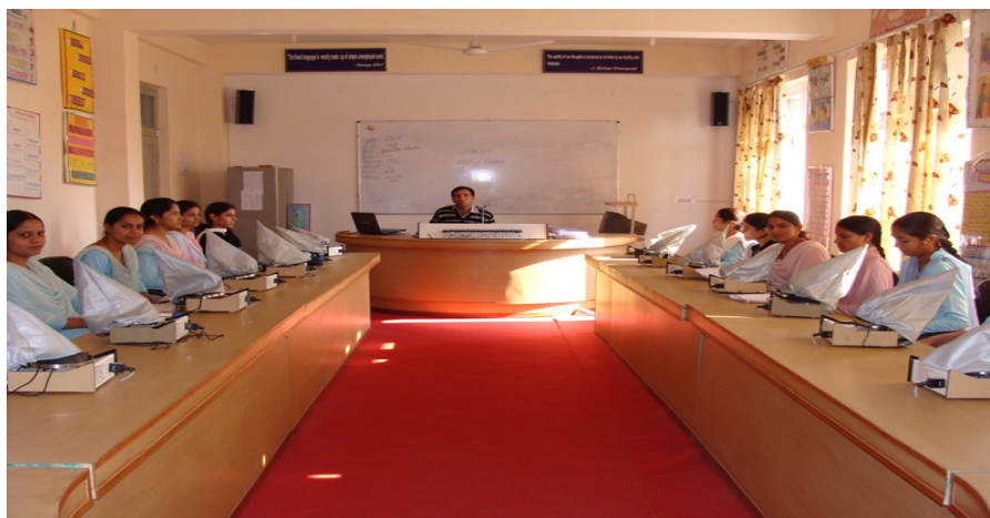
Improving Skills during Language Lab Class