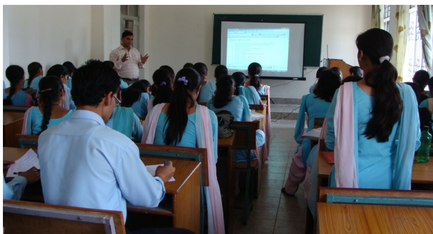
Use of ICT for Teaching - Learning Process