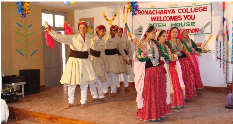
Presenting a Cultural Performance during Inter House Competition