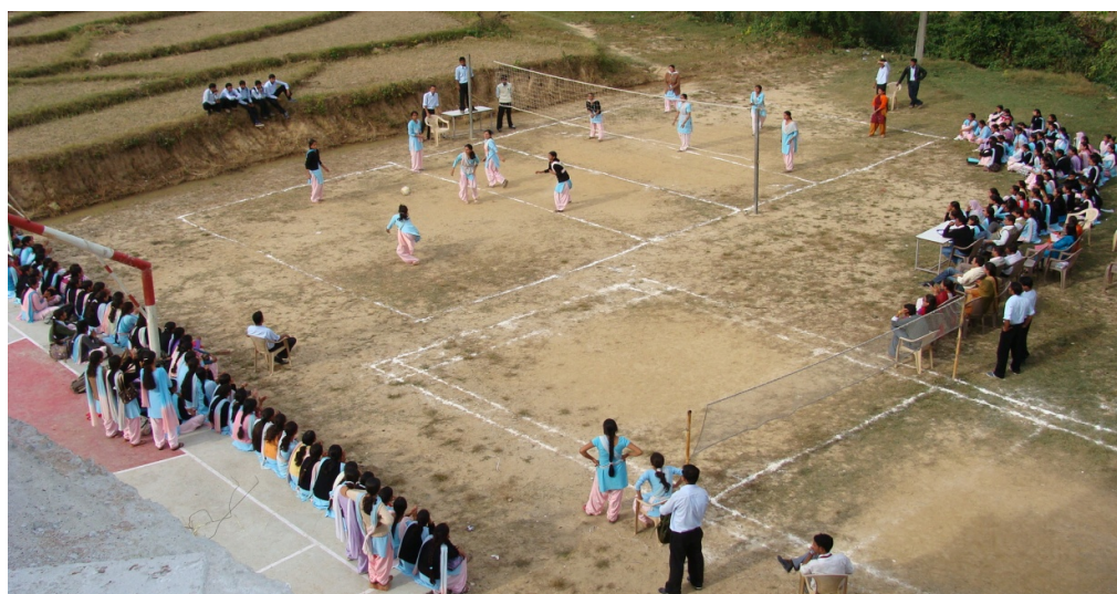
Students participating in Sports Meet

Our college realizes the significance of sports and encourages its student to take part in these activities. Students of the college took active part in Inter House and Inter College Sports Competition particularly during Athletic Meet and excelled in various events such as races, high and long jump, volleyball and badminton.