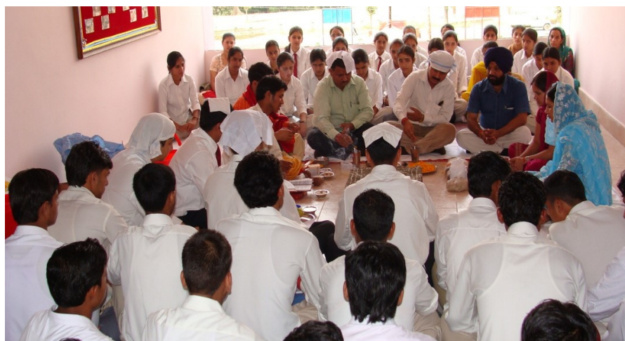
Beginning of the Session with Holy Yagna & Pooja

The IQAC has been continuing its efforts for quality up gradation of the institution. At the beginning of the session, IQAC had taken some steps to enhance the academic and other activities of the institution.