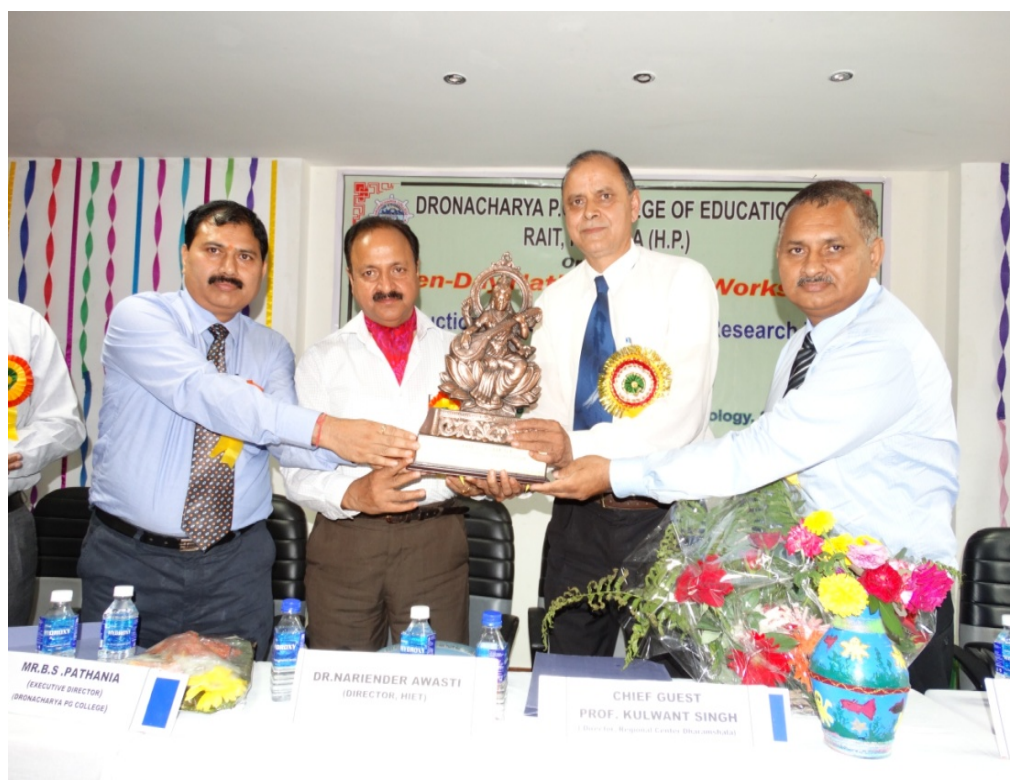
Seven-day Workshop on “Construction and Standardization of Research Tools”