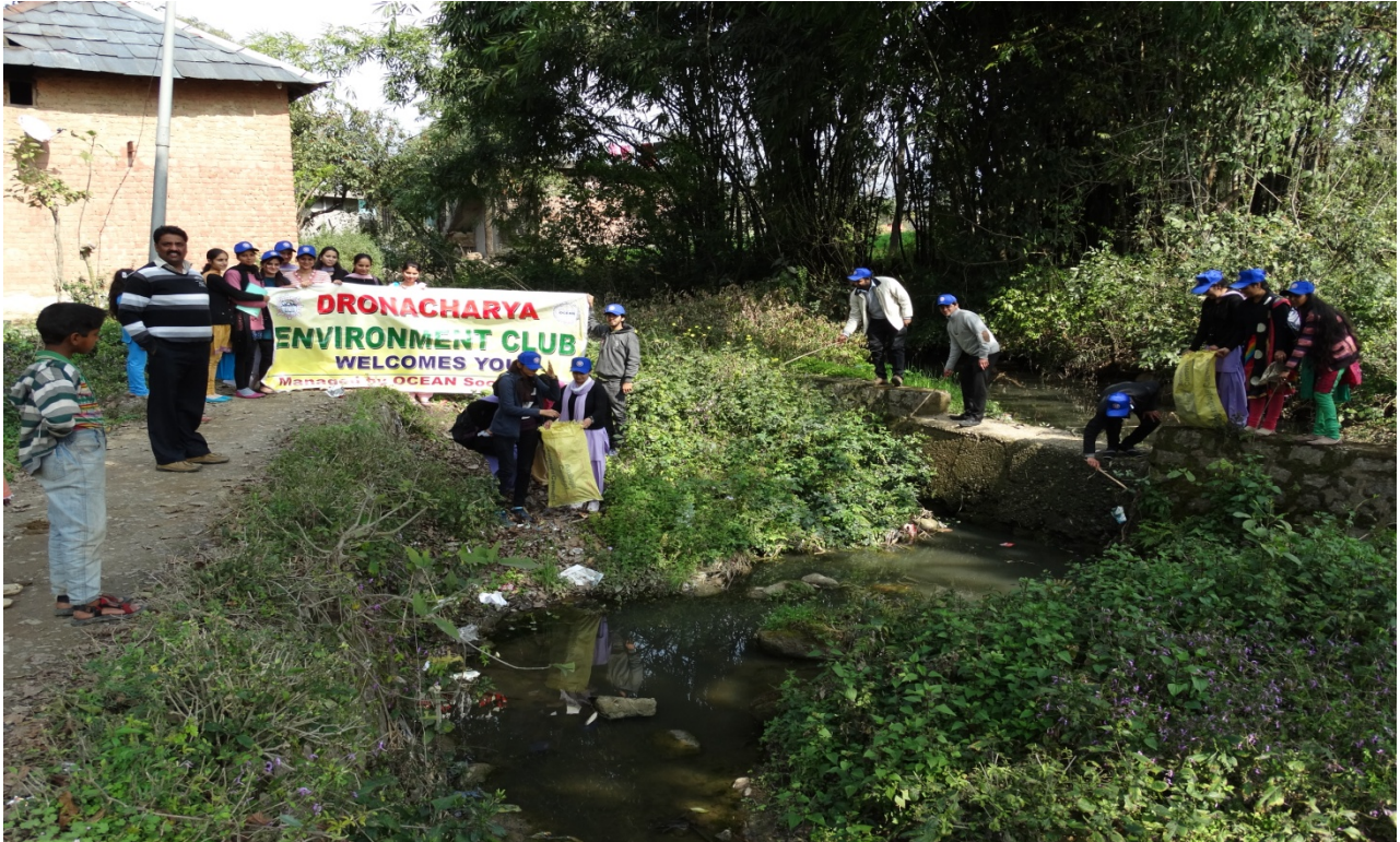
Dronacharya Environment Club Members Cleaning The Area In Basnoor Village