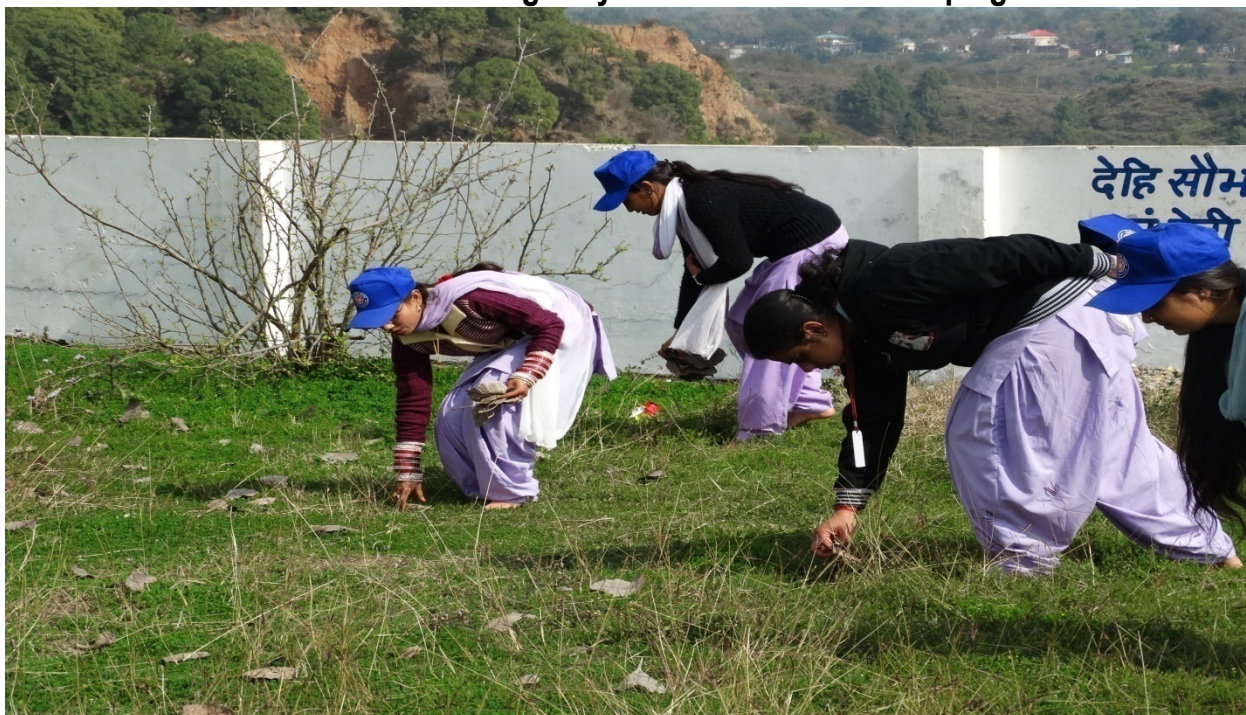
Dronacharya Environment Club Members Cleaning the Area Near Chambi