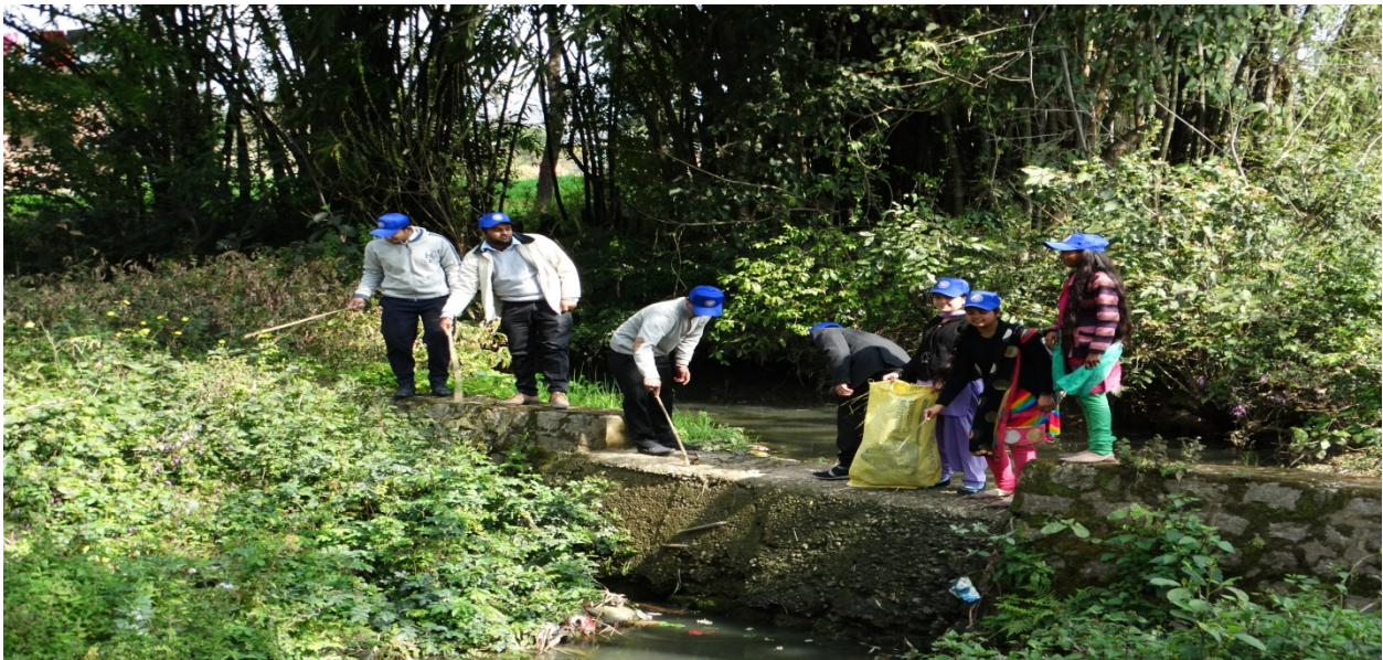
Environment Club Members Cleaning The Water Resource