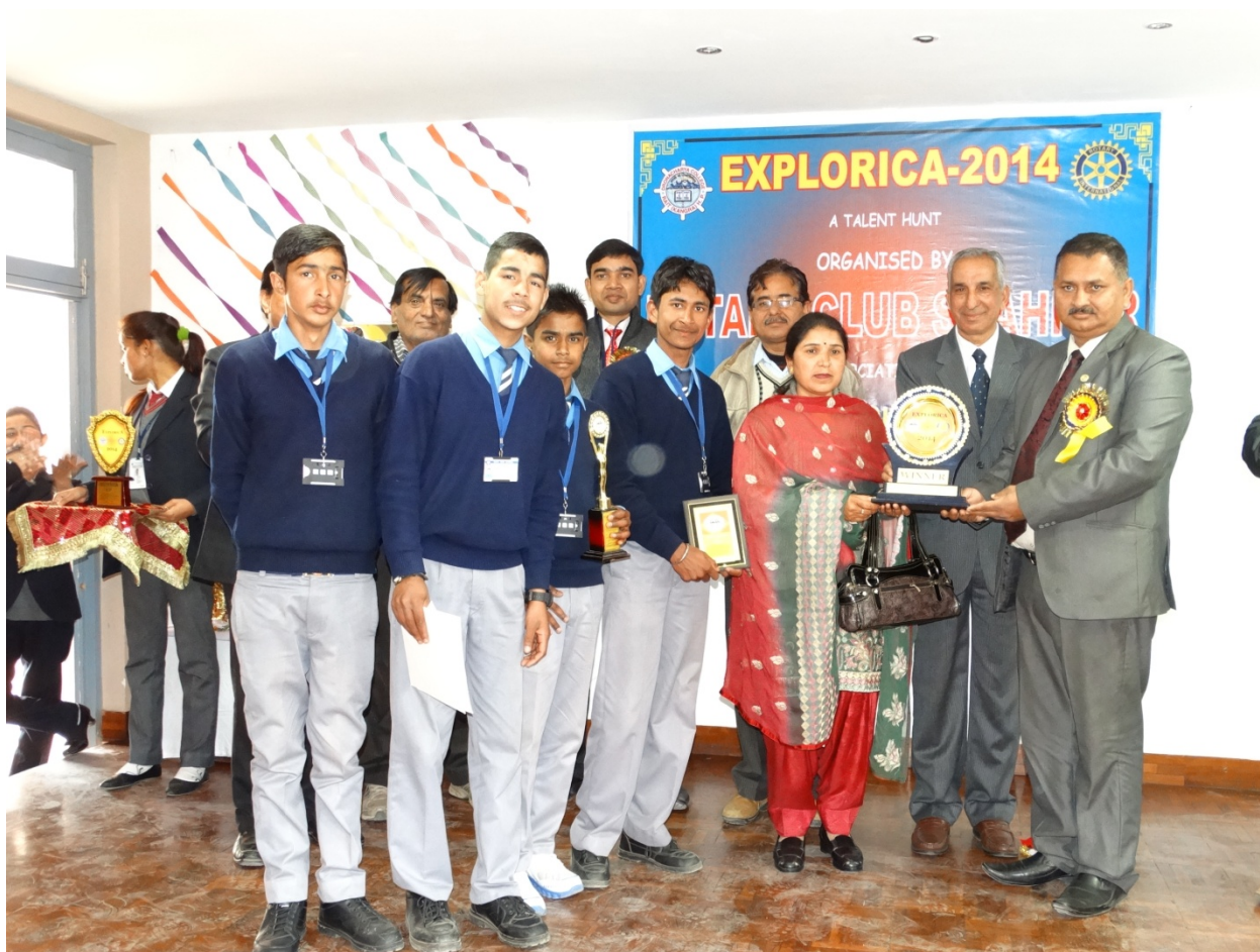
Prize distribution by president Rotary Club in Explorica, 2014