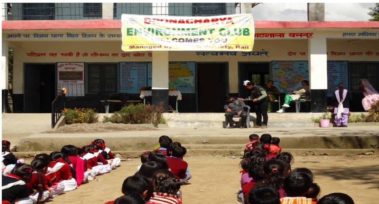
Dronacharya Environment Club Members Performing Skit In Govt. Middle School, Bagdu

A Quiz competition was organized in Government Middle School, Bagdu, on environment related issues. In same school a skit was also performed by the dronacharya environment club members, to aware the school students on environment related problems and about the harmful effects of polluted environment on them. These activities were conducted to encourage children to enhance their interest towards Environment.