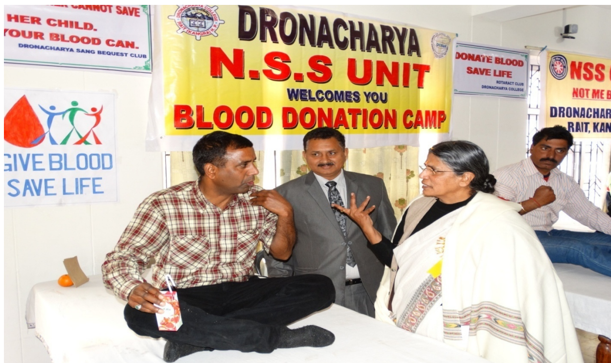
Volunteer Donating Blood in Dronacharya College