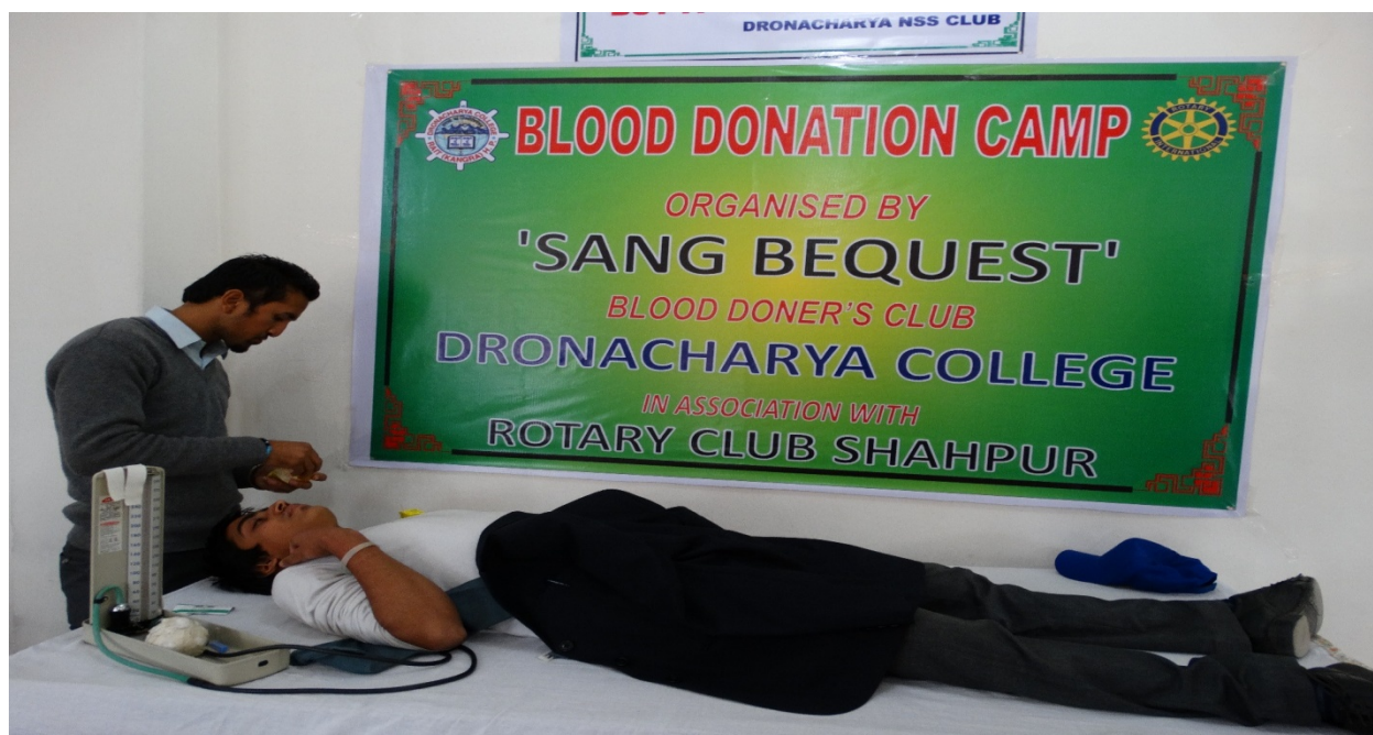
Blood donation camp organized by Sang Bequest Club