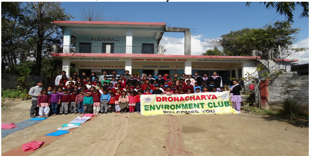
Dronacharya Environment Club Members With Govt. Middle School Students