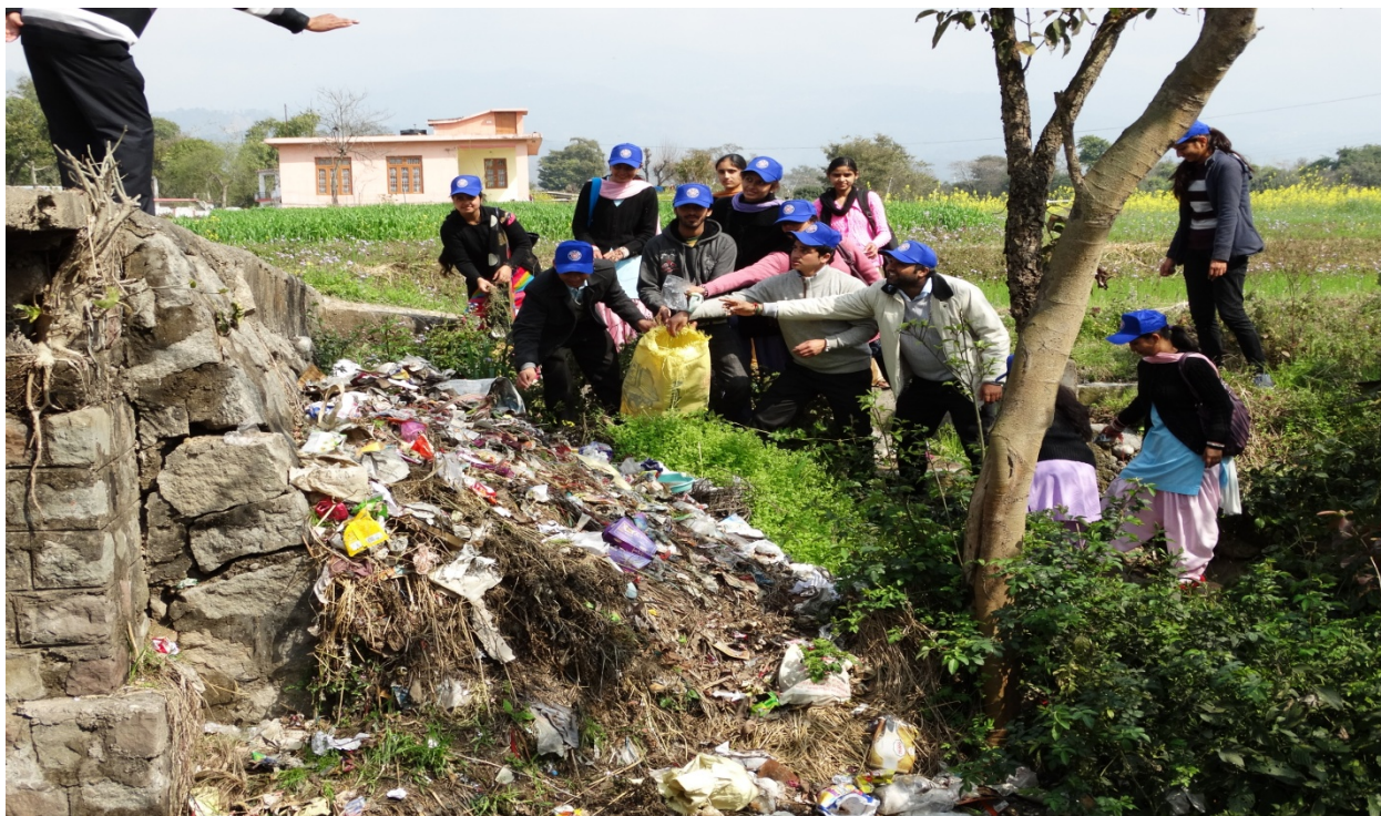
Club Members During Polythene Eradication Campaign