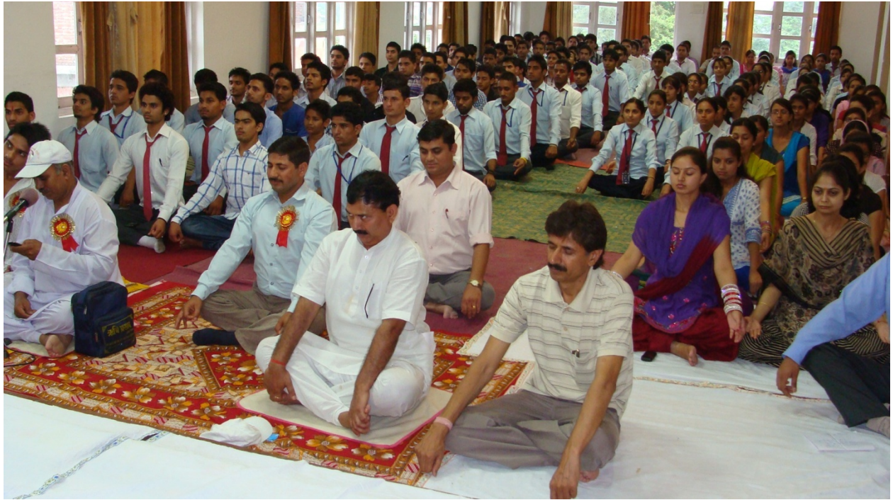
Yoga Shiver was organized by Rotract Club