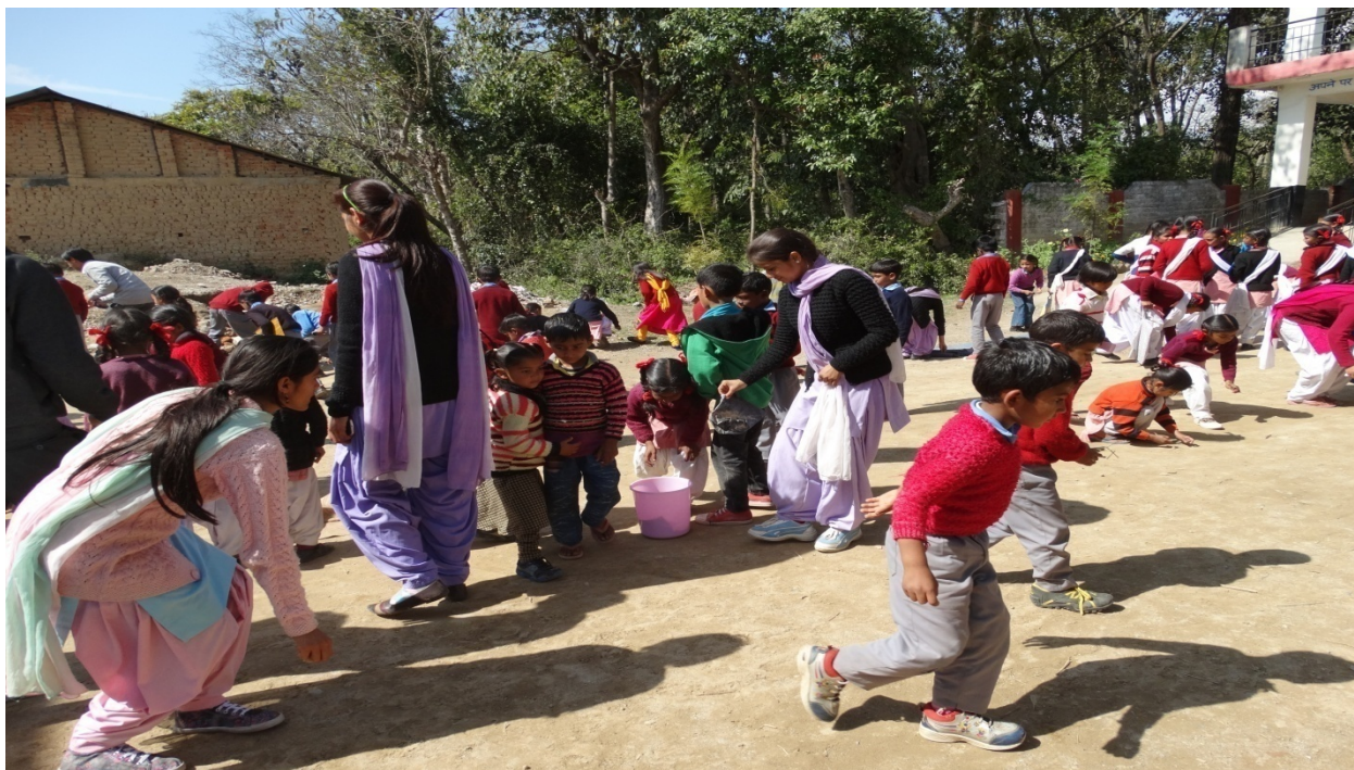
Dronacharya Environment Club Members Cleaning The School Campus With School Students

Dronacharya Environment Club organized various like rallies, quiz competition on the theme 'Save Environment' in different government schools (G.S.S.S. Shahpur, G.S.S.S. Sehwan, G.S.S.S. Rait, G.S.S. Durgella) to aware the community, on 5 th June, 2014