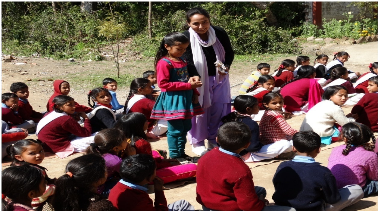
Prize Winner In Quiz With Dronacharya Environment Club Member